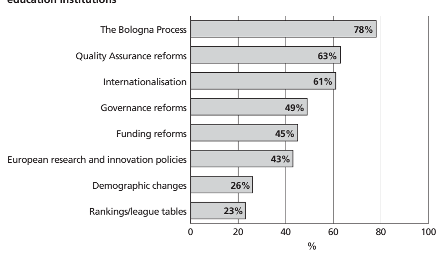
Figure 1: The importance of different developments in strategies of European higher education institutions