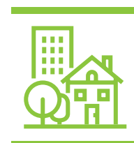
Health & Living Conditions