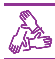
Health & Personal and Community Capabilities