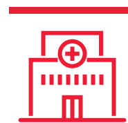
Health & Health Services