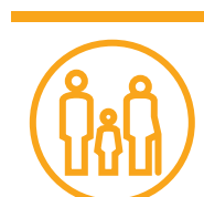
Health & Income and Social Protection