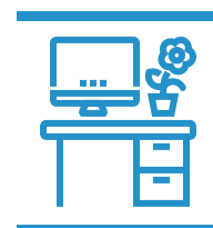
Health & Employment and Working Conditions