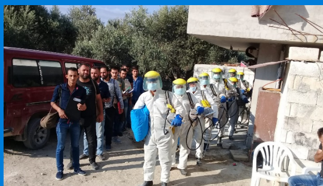
Teams are preparing to spray the homes of families in north-western Syria with insecticides. The insecticide will assist in limiting the multiplication of sand flies and therefore transmission just before the summer months, when they are most active.