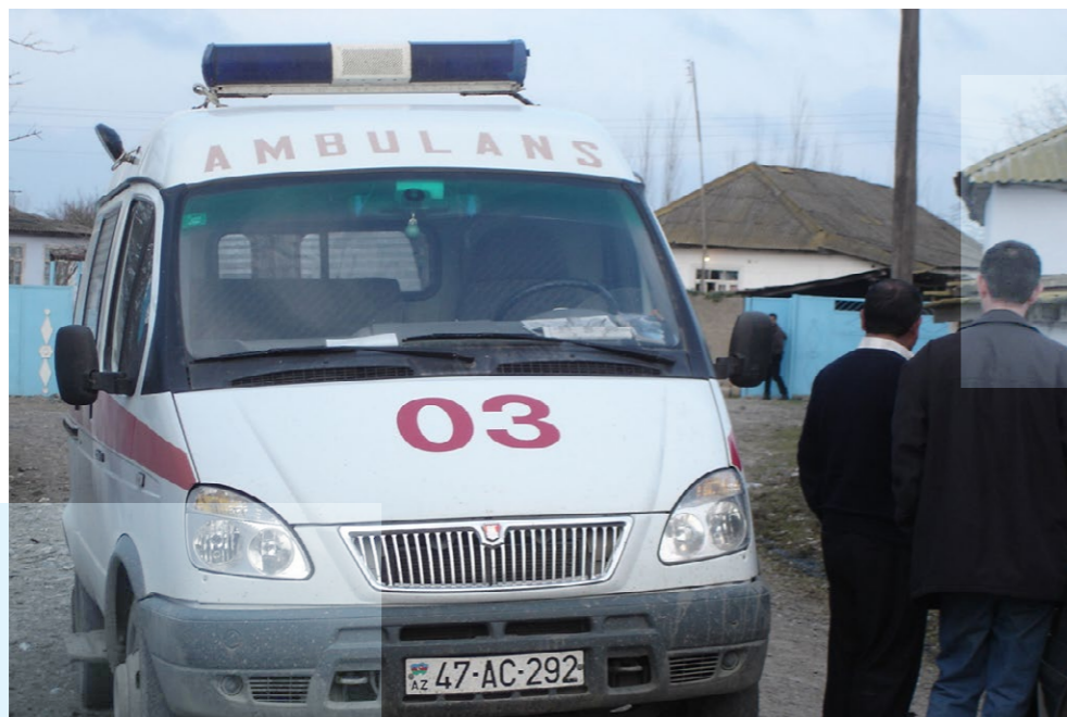
Ambulance in Salyan Neftchala settlement

National experts were trained on Public Health Emergency Management. This team, coordinated by the Ministry of Health and WHO, finalized an assessment of health care facilities for emergency preparedness in Baku and the regions.