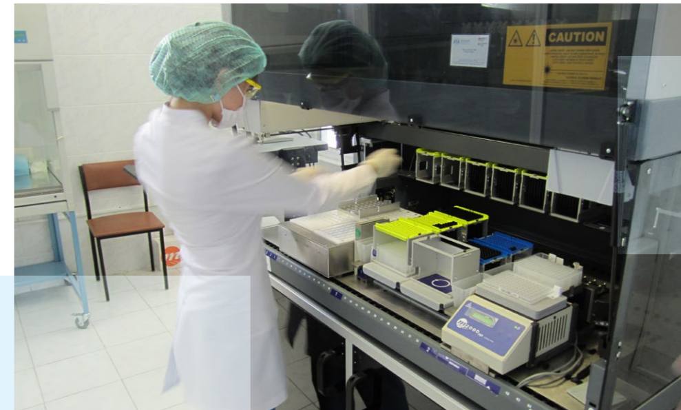
Lab worker analyzing blood samples in a laboratory at National Centre in Baku