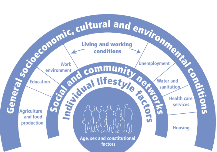
Figure 1. The factors influencing health