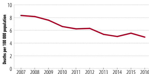
Trends in reported road traffic deaths