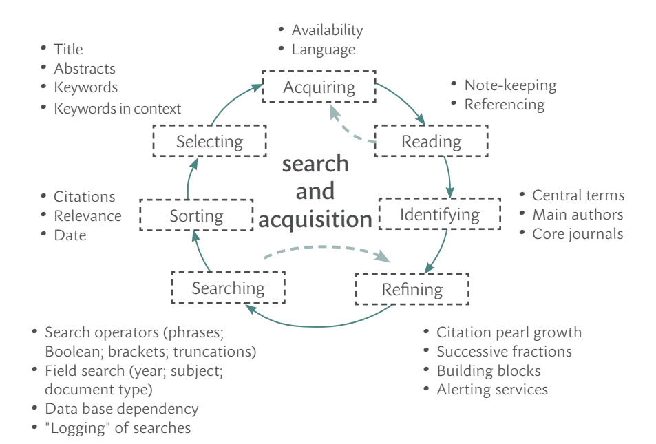
Fig. 2 More detailed illustration of the search phase in hermeneutic review (adapted with permission from Boell and Cecez-Kecmanovic (1))