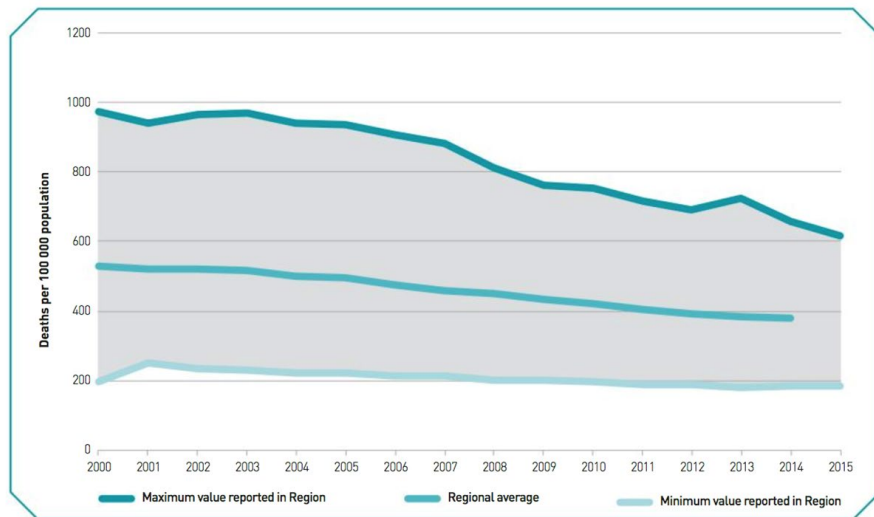
Figure 2.1. Age-standardized overall premature mortality rate (from 30 to under 70 years old) for four major noncommunicable diseases (cardiovascular diseases, cancer, diabetes mellitus and chronic respiratory diseases), deaths per 100 000 population