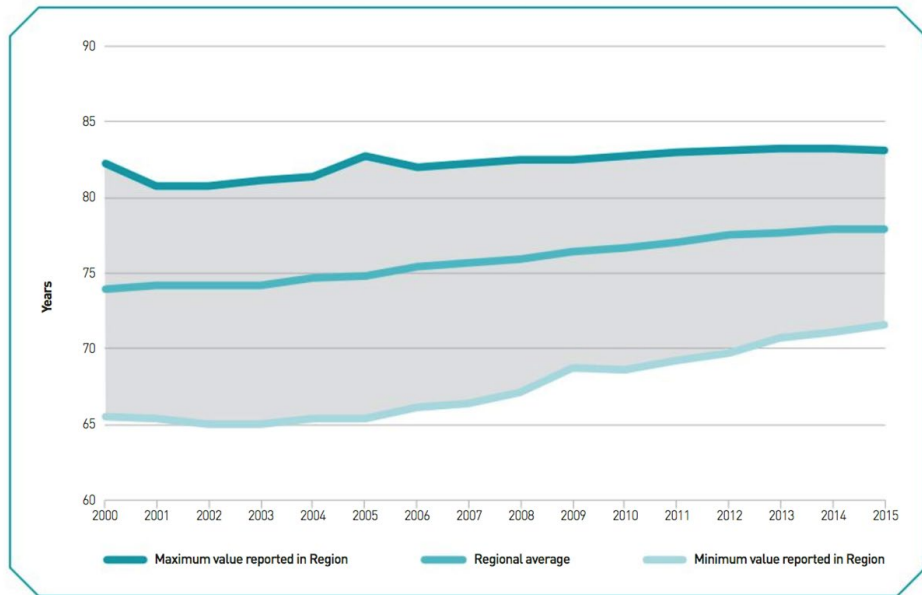
Figure 2.17. Life expectancy at birth (years)

Source: Health for All database on the WHO European Health Information Gateway (9).