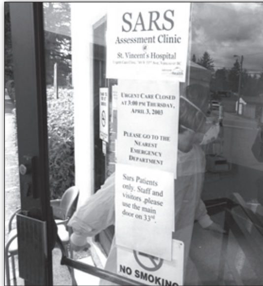
Fig. 3. Hospital access restrictions for visitors in Canada

last days of March, hospital restrictions started. The restrictions cancelled all elective surgical procedures, limited the visits of patients' relatives and restricted patient transfers between hospitals. The patients and visitors at many health care facilities were screened for high temperature.