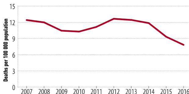
Trends in reported road traffic deaths