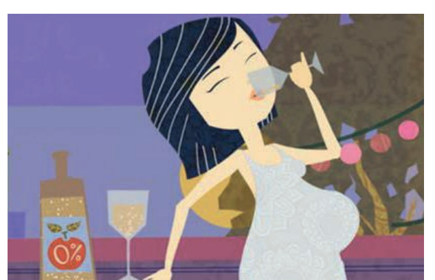
Fig. 2. Picture from the Norwegian national Alcohol-free Pregnancy campaign

A pilot project was carried out in 2012-2014 in Rogaland County to test early consultations on alcohol and lifestyle habits by midwives at health centres, where women were offered an additional consultation before their first appointment. The consultation was based on counselling style motivational interviewing and included assessments using TWEAK. A booklet was compiled for health professionals during the project to support and harmonize the consultation (available in Norwegian and English). The project was evaluated by the International Research Institute of Stavanger, which found that women and midwives were very content with the consultation and would recommend it to others. The outcome will be assessed in the next revision of the guidelines for pregnancy care, and some municipalities continued to carry out the consultation after the project ended. Finally, Borgestad Competence Centre/KoRus Sør arranges an annual conference called "Barnet og Rusen" (The Child and Intoxication), which focuses on alcohol-related harm to children. The centre is an institution with a high level of competence in substance abuse which offers consulting, information material and courses to communities, health personnel and caregivers.