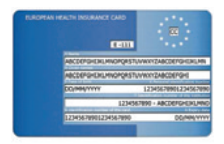
Figure 1: European health insurance card (EHIC)

An important element of this modernization is the European health insurance card (EHIC). The establishment of this card was decided at the Barcelona European Council (March 2002) to promote occupational mobility in the context of the Lisbon agenda and to demonstrate the benefits of Europe to its citizens. The EHIC, designed to replace all existing paper forms required for occasional health treatment when in another Member State (E111, E110, E119, E128), was presented as a way to simplify procedures for patients, providers and administrations (see Figure 1).