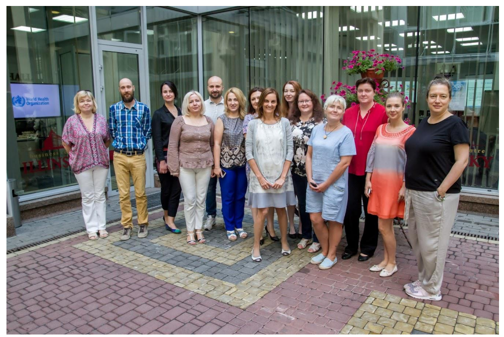
Participants of the ERC Plan writing workshop in Kyiv.

• Ongoing measles outbreak: since January 2018, over 24 000 people have been affected by measles, including 14 345 children. Most of the cases reported so far in 2018 have occurred in western regions of Ukraine (Chernivtsi, Ivano-Frankivsk, Lviv, Odesa and Transcarpathia).