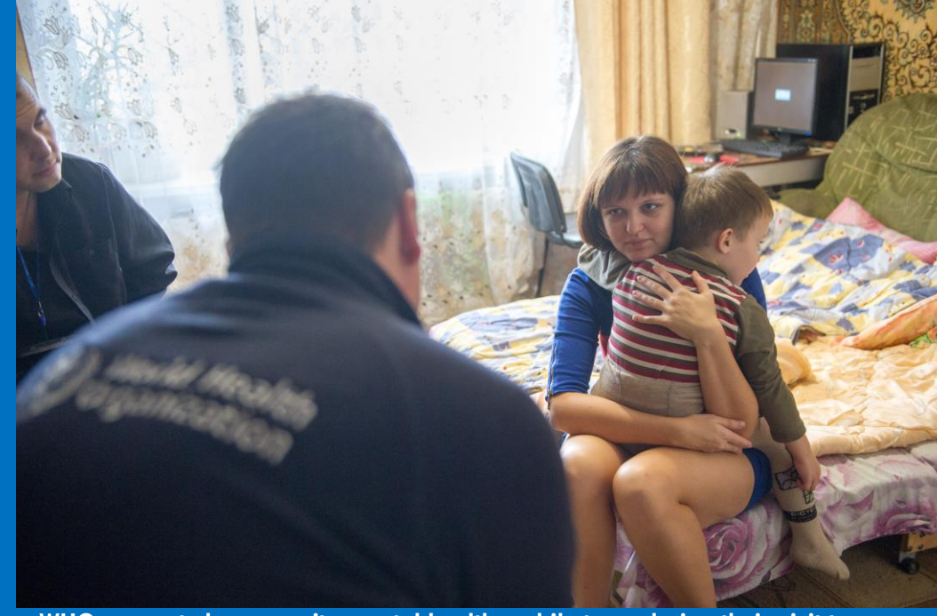
WHO-supported community mental health mobile team during their visit to a patient.