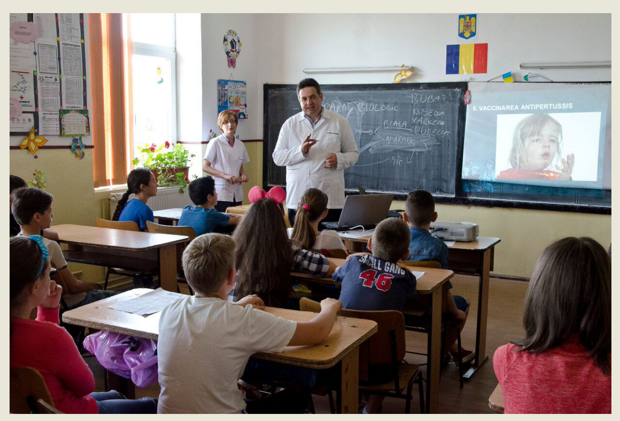
Special lesson on vaccines taught by local paediatrician, Romania