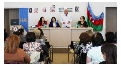
Press conference, Azerbaijan

of Moldova and Tajikistan. Press releases and/or press conferences drew extra media attention in Austria, Azerbaijan, Bosnia and Herzegovina, Georgia, Germany, Iceland, Kazakhstan, Monaco, Romania, Russian Federation and Tajikistan.