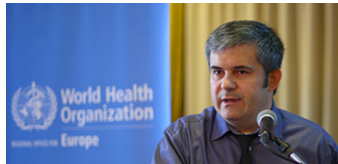
Presentation by WHO on the Refugee Health Training Programme at the media workshop in Ankara.

WHO represented United Nations agencies in the country at a debate on refugees in Turkey in a public health perspective at Hacettepe University in Ankara on 16 November 2017. In a session on what United Nations agencies do already and what more they can do, the WHO Country Office in Turkey presented its programme supporting the Turkish health system in coping with the high influx of people and extending the delivery of health services to the refugees.