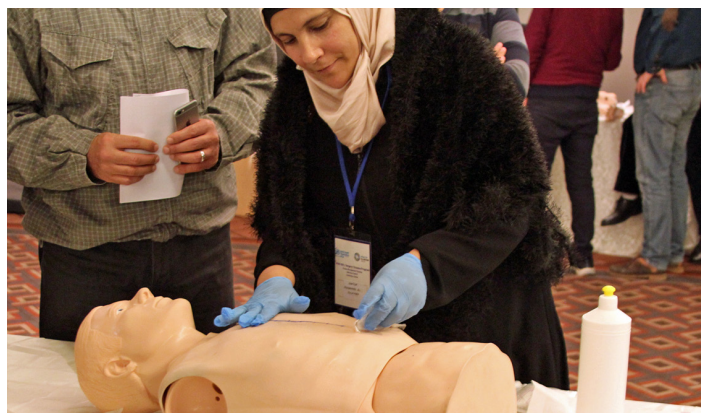
A Syrian health care worker practises proper wound cleaning during a training course on infection control organized by the WHO field office in Gaziantep.

Supporting mental health. WHO provided video training and online clinical supervision in treating mental illnesses to Syrian health workers who cannot leave besieged eastern Ghouta.