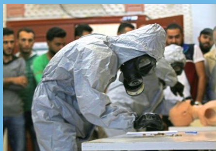
Preparing for the worst, health workers in hazmat suits

In September and November, WHO delivered life-saving medical supplies to over 200 health facilities in five cross-border shipments. Supplies included essential medicines, surgical and burn kits and cholera medicines for approximately 896 810 treatment courses.