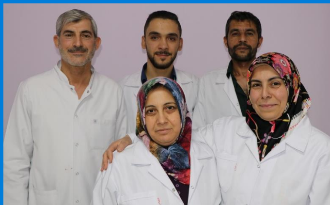
Upon completion of the adaptation training, these Syrian health care workers were hired in the Gaziantep Refugee Health Training Centre, where they work hand in hand to serve their community in Turkey.