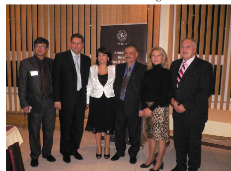
Network meeting dinner 2007

More information about the Best Practice Awards can be found by following the link: http://www.uclan.ac.uk/facs/health/hsdu/settings/who_awards_2007.html