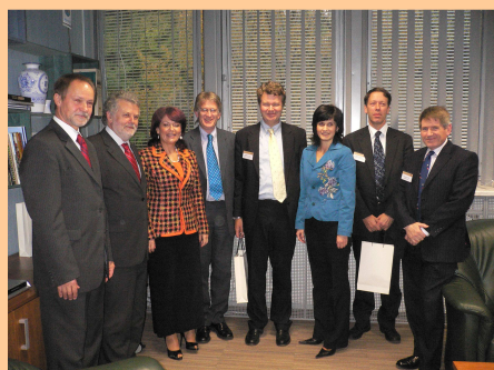
Meeting with Self-Governing Region of Trenčín