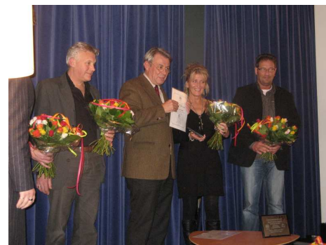
Best Practice Awards The Netherlands