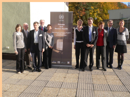
Network meeting 2007, Slovakia