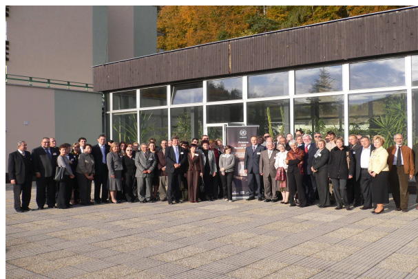
Network meeting 2007, Slovakia