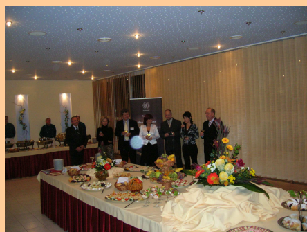
Network meeting 2007, Slovakia