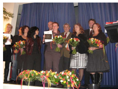
Best Practice Awards The Netherlands