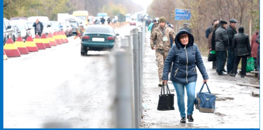
People crossing the contact line at Mayorske exit/entrance checkpoint. Harsh winter conditions and long queues put their health at risk, especially for vulnerable people. Up to 40 000 individual crossings per day were recorded at five checkpoints.