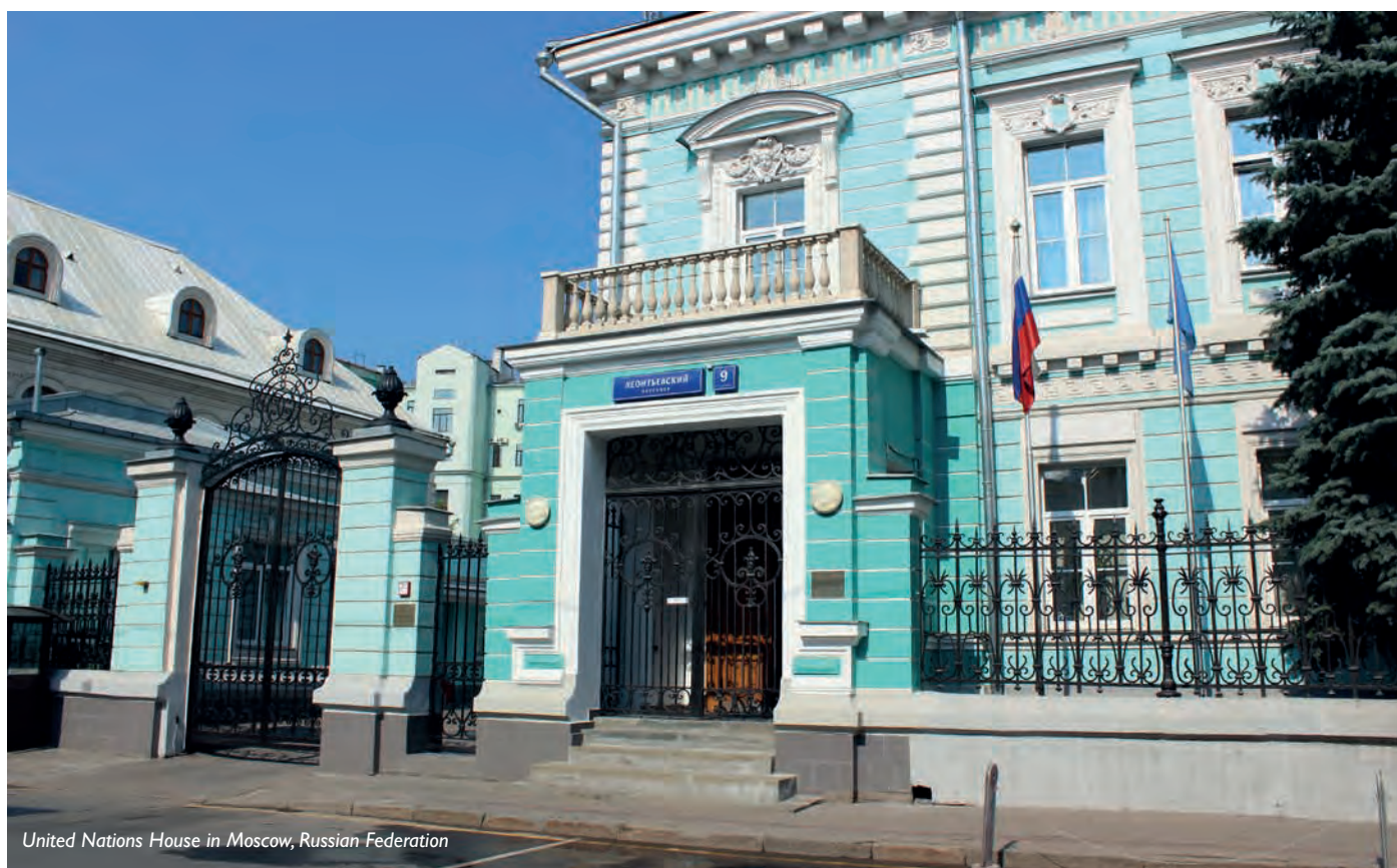
United Nations House in Moscow, Russian Federation