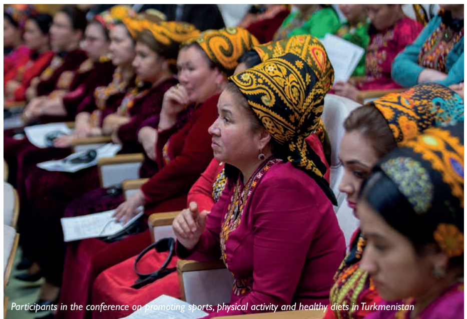
Participants in the conference on promoting sports, physical activity and healthy diets in Turkmenistan