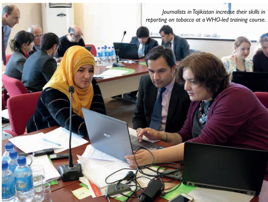
Journalists in Tajikistan increase their skills in reporting on tobacco at a WHO-led training course.

The new publication is designed to lead to action. It considers what barriers currently exist, what types of physical activity can be promoted, who should be targeted and when, and how best to plan and implement appropriate measures, adjusting for social justice and equity. This includes consideration of design in the use of inner-city land, housing estates, transport and public spaces. Political agreement is important in making progress, and cities can take simple steps, even within their current planning policies, that will make a difference. A grant from the Government of the Russian Federation enabled this report to be translated into Russian.