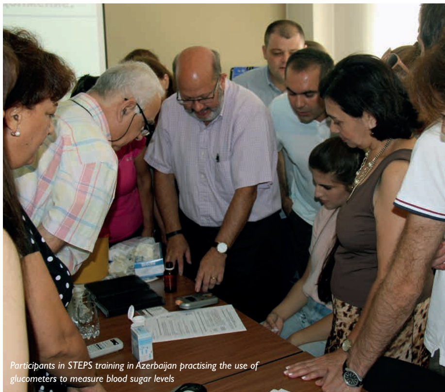
Participants in STEPS training in Azerbaijan practising the use of glucometers to measure blood sugar levels

In 2017, for the first time, all 53 Member States in the WHO European Region responded to the survey. To improve the accuracy of the survey results, the NCD Office implemented an innovative strategy for their validation: all relevant programme managers, technical officers and heads of country offices were invited to provide