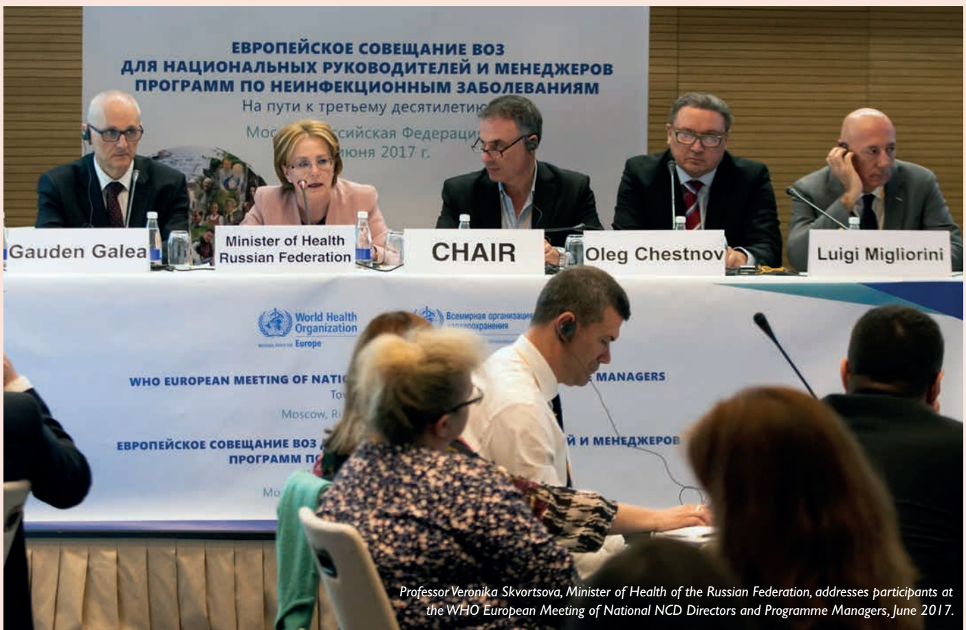
Professor Veronika Skvortsova, Minister of Health of the Russian Federation, addresses participants at the WHO European Meeting of National NCD Directors and Programme Managers, June 2017.