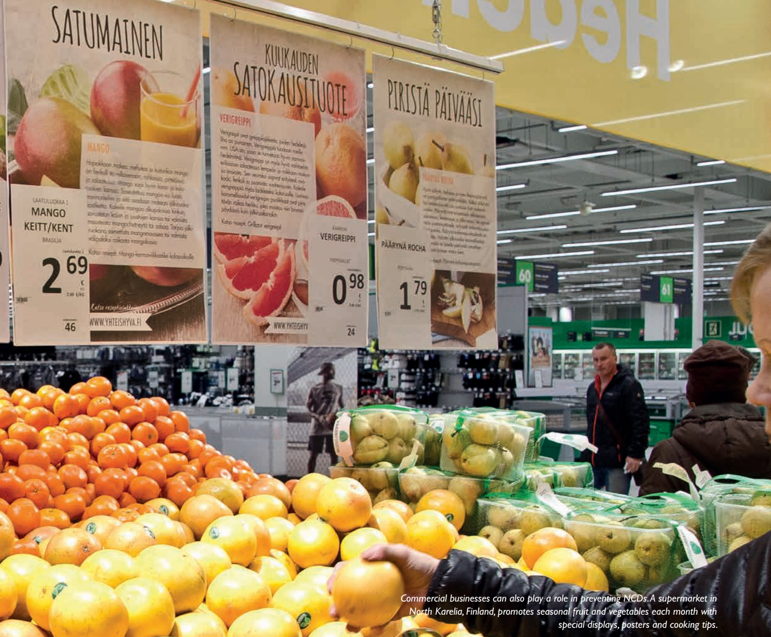
Commercial businesses can also play a role in preventing NCDs. A supermarket in North Karelia, Finland, promotes seasonal fruit and vegetables each month with special displays, posters and cooking tips.

outside the traditional health system. This includes areas of the private sector which profit from tobacco, alcohol and food that is high in energy, fats, sugars or salt.