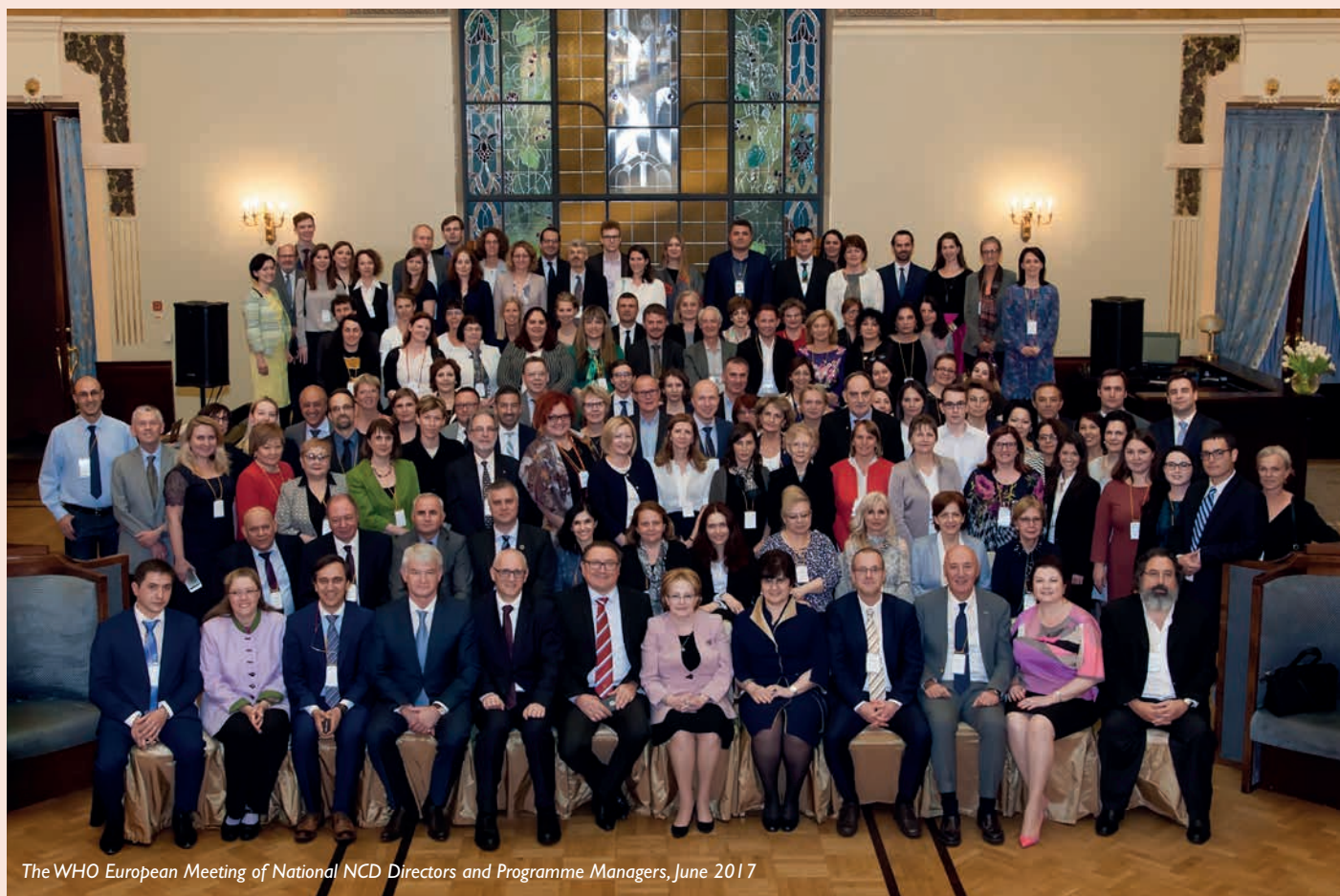
The WHO European Meeting of National NCD Directors and Programme Managers, June 2017

Major inequities also persist within countries in the Region, between populations from different socioeconomic groups and those living in different geographical areas. Recent analyses conducted by the NCD Office revealed strong gender inequity: most