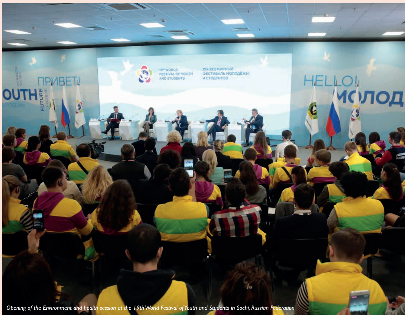
Opening of the Environment and health session at the 19th World Festival of Youth and Students in Sochi, Russian Federation

“Young people have a tremendous role to play in transforming our societies for the future we want, by taking action and protecting population health and the planet. They can drive forward the SDGs.”