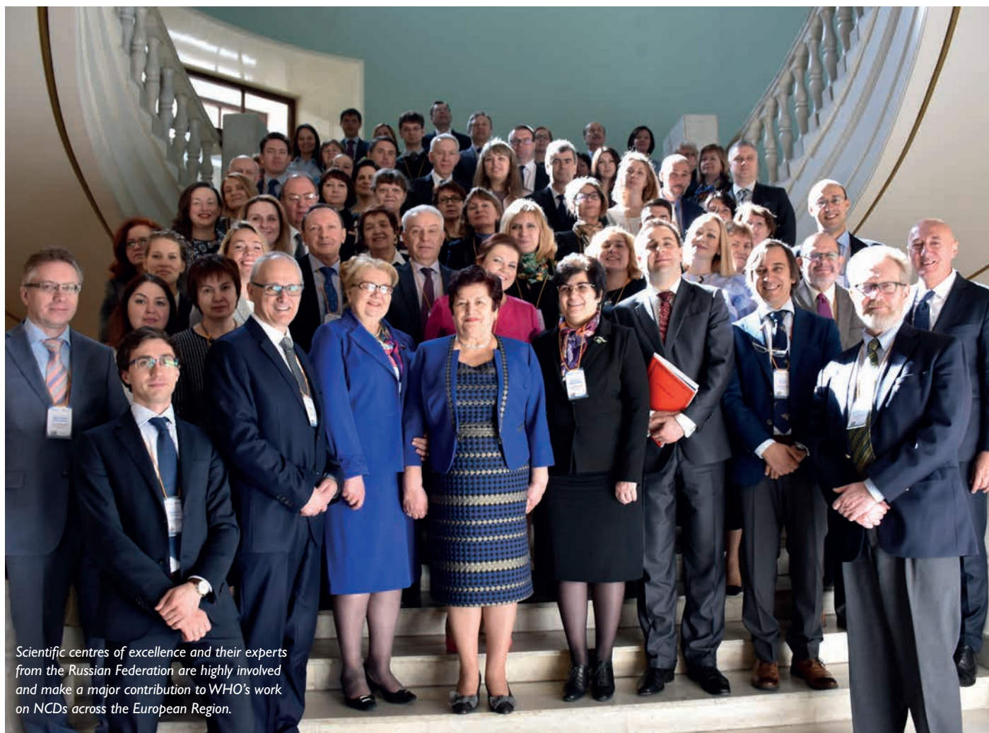
Scientific centres of excellence and their experts from the Russian Federation are highly involved and make a major contribution to WHO's work on NCDs across the European Region.