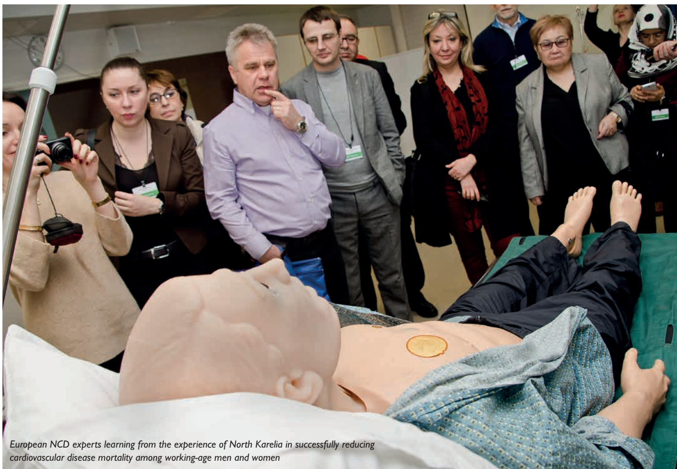
European NCD experts learning from the experience of North Karelia in successfully reducing cardiovascular disease mortality among working-age men and women

A comprehensive approach reduces the NCD burden by integrating health promotion, disease prevention and chronic care management, responding to acute episodes of illness and providing rehabilitation and palliative care when needed.