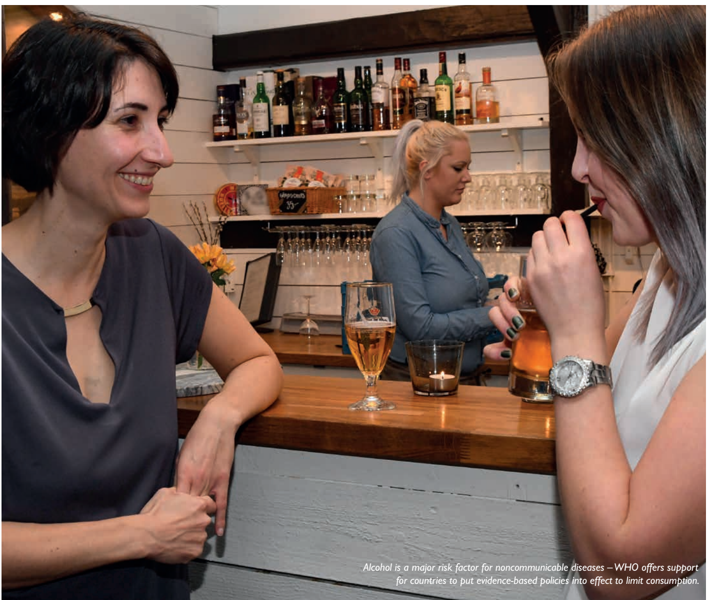
Alcohol is a major risk factor for noncommunicable diseases – WHO offers support for countries to put evidence-based policies into effect to limit consumption.

During the workshop and through follow-up support exercises since, countries have identified existing national interventions in their countries for the prevention and control of NCDs, and have developed study protocols that will use natural experiment study techniques to evaluate these. Six countries (Austria, Hungary, Romania, the Russian Federation, Turkey and Ukraine) are currently involved in the project, running seven studies in total (testing alcohol control, trans-fats