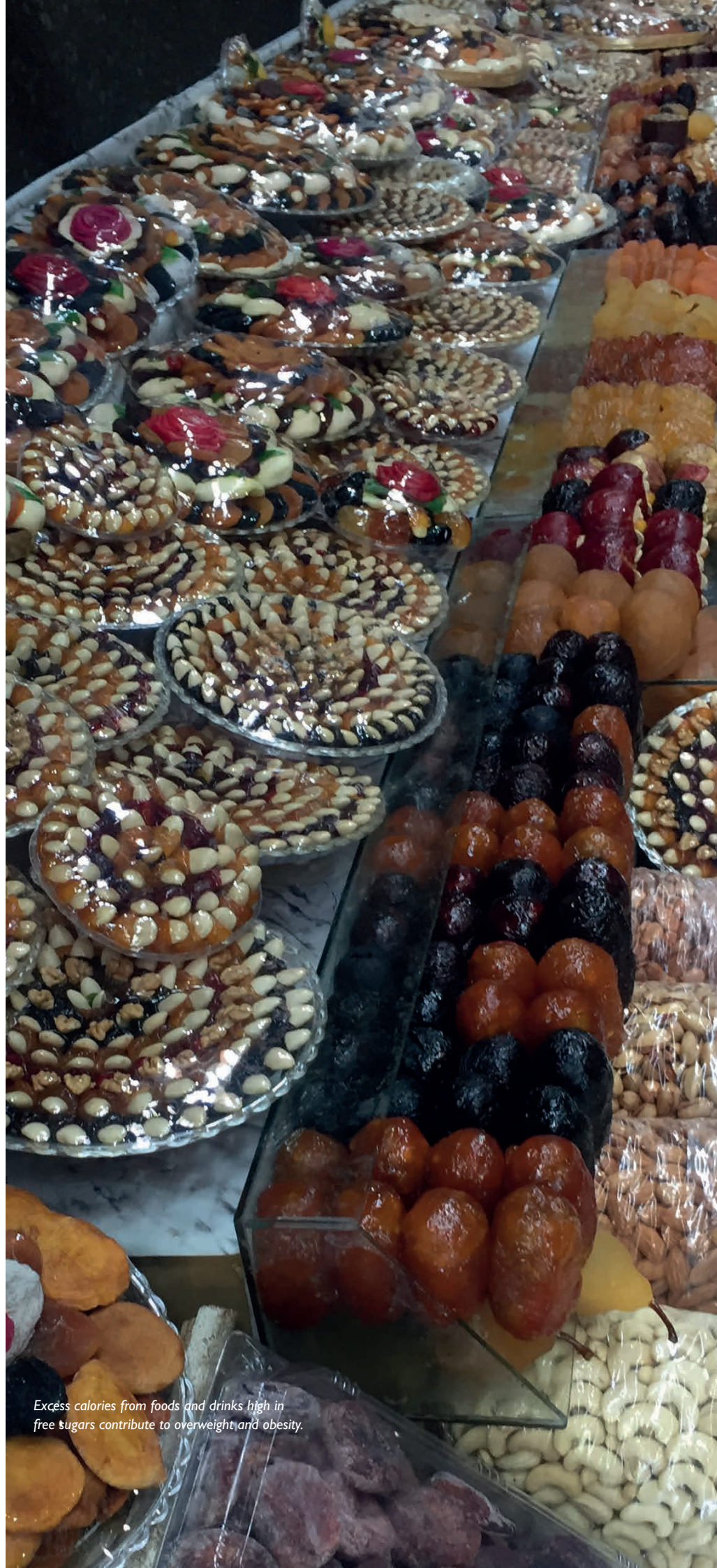
Excess calories from foods and drinks high in free sugars contribute to overweight and obesity.

Obesity is preventable. Ending obesity, however, is very complex. The prevalence of childhood obesity in nearly every country around the globe is increasing at an unprecedented rate, and yet few countries have pushed this public health issue to the