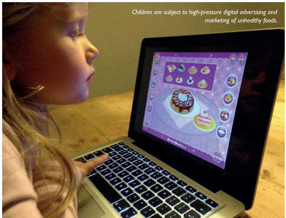
Children are subject to high-pressure digital advertising and marketing of unhealthy foods.

The report was launched in Moscow, Russian Federation, and Porto, Portugal, and received wide coverage in international media. At the launch, the HBSC principal