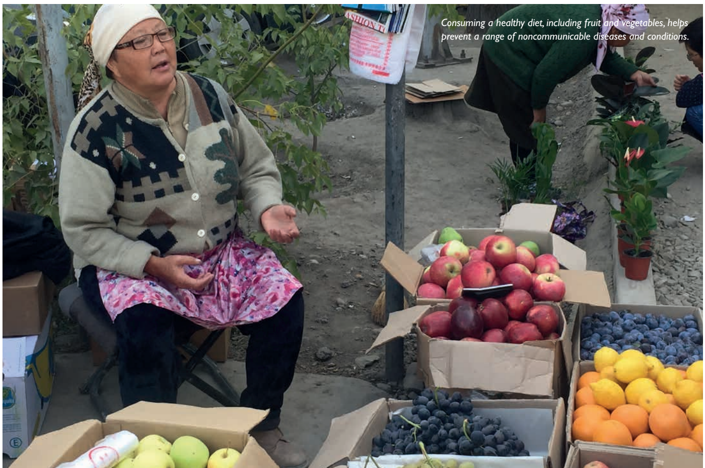
Consuming a healthy diet, including fruit and vegetables, helps prevent a range of noncommunicable diseases and conditions.

Cardiovascular diseases, particularly heart attacks and strokes, are major killers for both men and women, but can also be chronic diseases that many millions have to endure. They make a huge call on health system resources. The results of these reviews, carefully calibrated for the national context, will be used to strengthen the organization and delivery of acute care and rehabilitation services for heart attacks and strokes. While focusing on preventing NCDs, WHO will also ensure that countries share the progress they are making in responding to these devastating diseases. Further work is now focused on developing a cardiovascular disease roadmap with the support of funding from the Government of the Russian Federation.