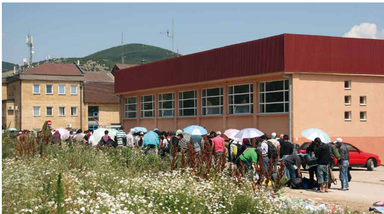
Fig. 3. Migrants waiting to start their asylum application process at the police station in Presevo, Serbia