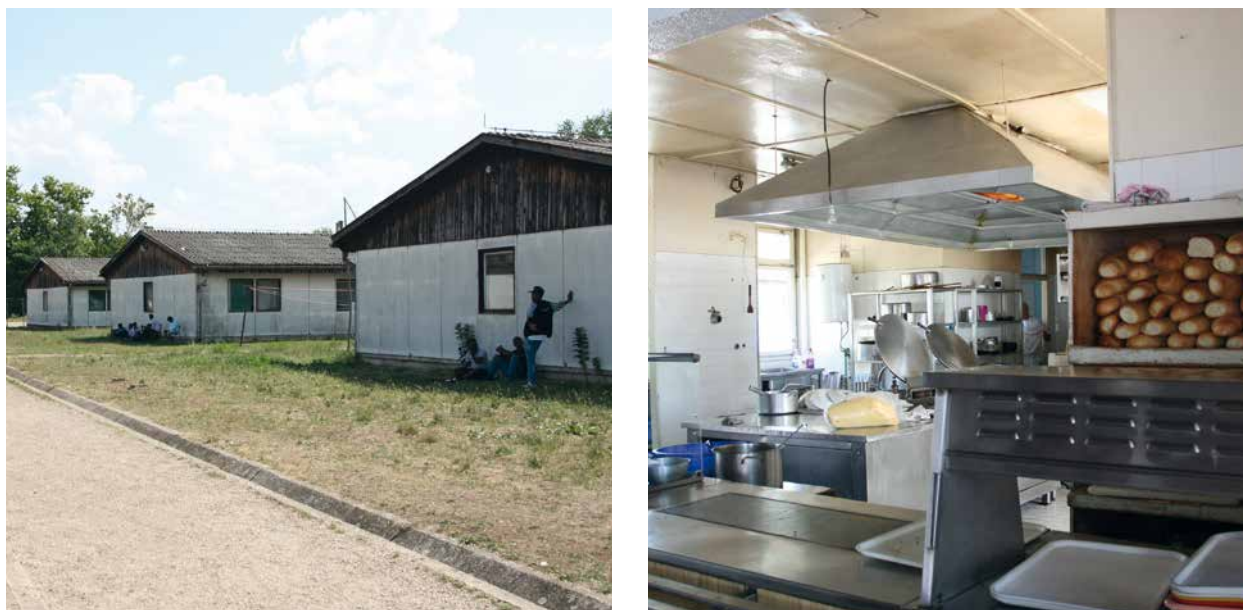
Fig. 6. Asylum centre in Krnjaca, Serbia

The mission team also visited the asylum centre in Krnjaca (Fig. 6). This is one of the remaining collective centres, housing Bosnian and Croatian families who have lived here for up to 25 years. One part of this centre is now organized as an asylum centre for 250–270 asylum-seekers although, at the time of the visit, 140 people were resident: 100 men, 37 women, and three children. There was one family and one unaccompanied minor (15 years old). The minor has been housed in the building where the staff have their office, so that they can keep an eye on him. He has a guardian appointed by the Ministry of Labour, Employment, Veteran and Social Policy.