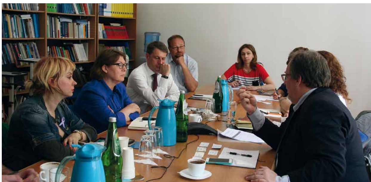
Fig. 1. Meeting with the United Nations Country Team in Belgrade, Serbia