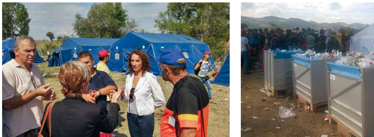
Fig. A.2. Left: Miratovac camp medical team. Right: Miratovac camp, garbage container