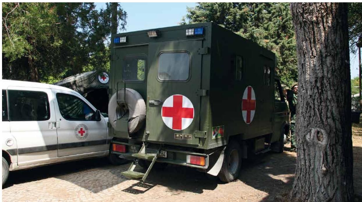
Fig. 8. Military clinical team vehicle at the processing centre in Presevo, Serbia

about safety or security. Some of the migrants had clearly been under a lot of pressure, anxious and queuing a long time outside the police station, and there had been some jostling and fights. One person had received minor injuries, but there had been no serious injuries.