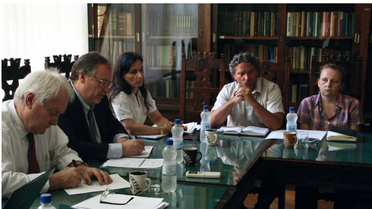
Fig. 2. Meeting with the Institute of Public Health in Belgrade, Serbia

The main agenda of the mission was the stakeholder roundtables at national and local level in Belgrade and Presevo. In addition, the team visited migration centres at Banja Koviljaca and Krnjaca in Belgrade, as well as the newly established processing centre in Presevo, in order to identify best practices/gaps and identify ways forward. During these visits, it was possible to interview all key actors, including managers and staff of the centres (Fig. 2). A small number of migrants were also interviewed. A meeting was held to discuss the international perspective and response to the migrant influxes with the United Nations Country Team, and briefings and debriefings were provided to UNHCR. However, it was not possible to visit all asylum centres in the country because of time constraints.