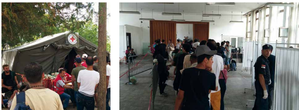
Fig. A.1. Left: Presevo one-stop reception centre. Right: Presevo registration and medical centre

Mobile toilets and shower cabins are available, provided by UNHCR, but the current capacity is insufficient to meet the growing needs. The Serbian Red Cross provides hygiene kits, but more are needed. Food packages are available only for women and children, while men have to find some way to buy food outside the camp. Bottled water is available, provided by the Red Cross. There is a need for guidelines on breastfeeding and nutritional support for infants and young children in reception centres.