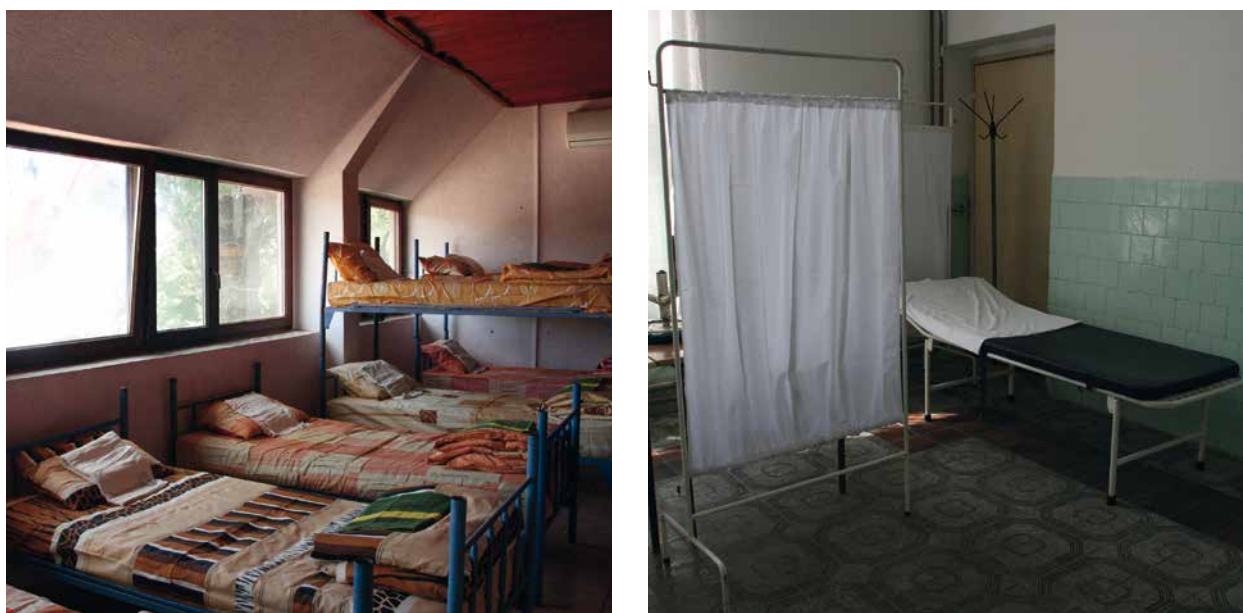
Fig. 7. Processing centre in Presevo, Serbia

This plan has been launched as an emergency measure, although thought will be given to longer-term needs once it is operational. Further planning will be necessary if the facilities at the centre continue to be needed during the coming winter.