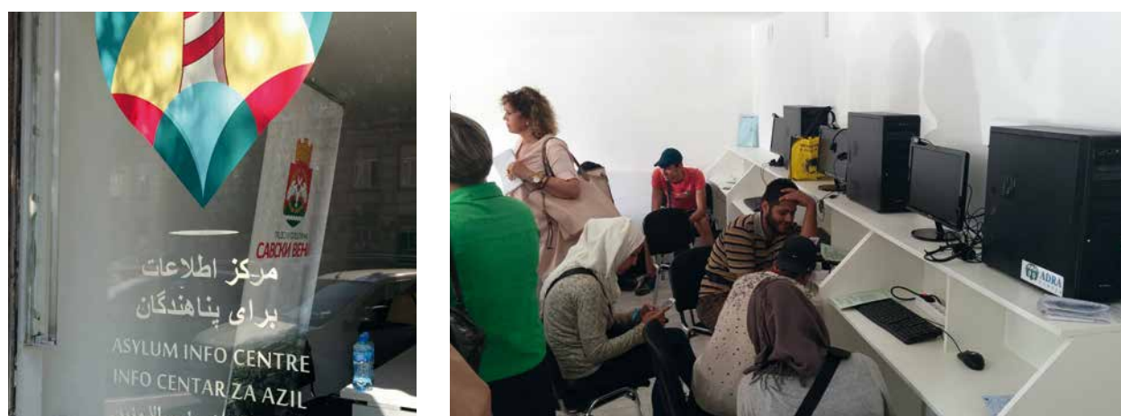
Fig. A.3. Asylum information centre, Belgrade

The newly opened asylum information centre was visited (see Fig. A.3). It is located near two city parks where refugees are living, and close to the railway station. There are computers available with free wireless Internet access, and legal advice can be obtained in this centre. Refugees can also obtain a variety of information, including health-related information. The centre is funded by the City of Belgrade, and has highly educated volunteers (medical students, psychologists, lawyers). They share leaflets and information about services of interest for refugees in the parks. Volunteers refer migrants to two primary health care centres, providing health services free of charge, but also to the asylum centre in Krnjaca. Food and water supplies, including toilets and shower cabins, are provided by the city and the Serbian Red Cross. Approximately 100 persons per day ask for legal advice.