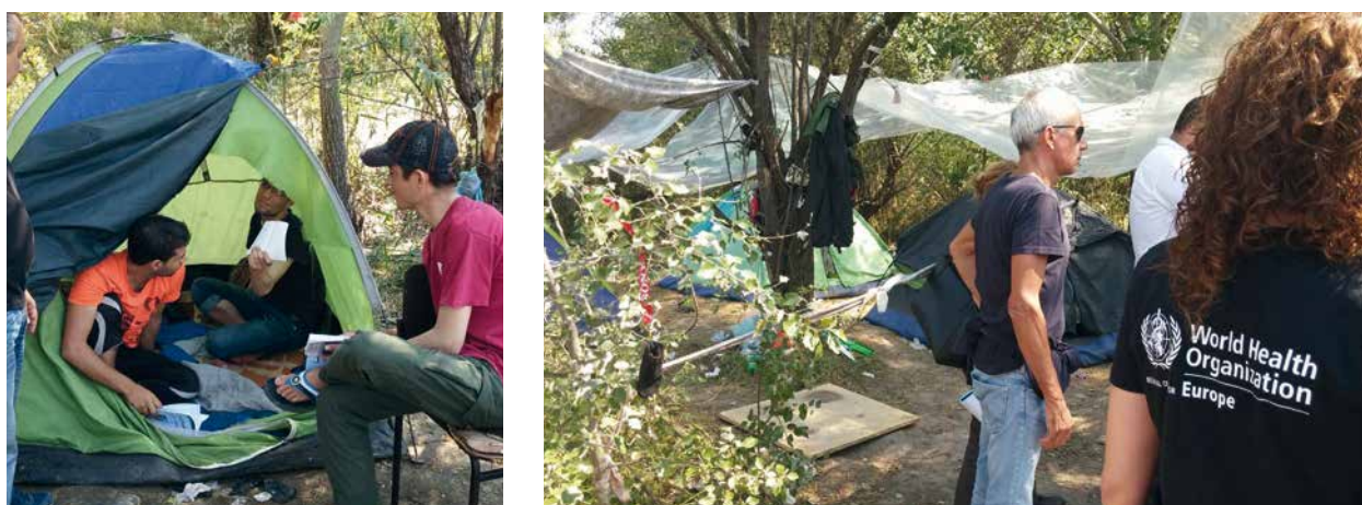
Fig. A.4. Shelter in old brick factory

This place is the most unfit for hosting migrants and is in very bad condition (see Fig. A.4). It was not set up by the municipality, but has been on a refugee route for many years. It is situated on private land, and the municipality cannot invest to improve the conditions. A few toilets were provided recently, as well as some small tents. Médecins Sans Frontières workers were present at the time of the visit, providing first aid and transportation to the nearest health facility in coordination with the Subotica emergency centre. Between 30 and 200 people per day visit this stop and stay there from 12 hours to three days (deputy Mayor of Subotica, personal communication, August 2015). Food and water are distributed by the Red Cross on the spot. No garbage containers are available. There is an improvised field shower and, as in other places visited, the Red Cross distributes hygiene kits. Refugees walk from here to the border with Hungary, and also use public transportation and taxis.