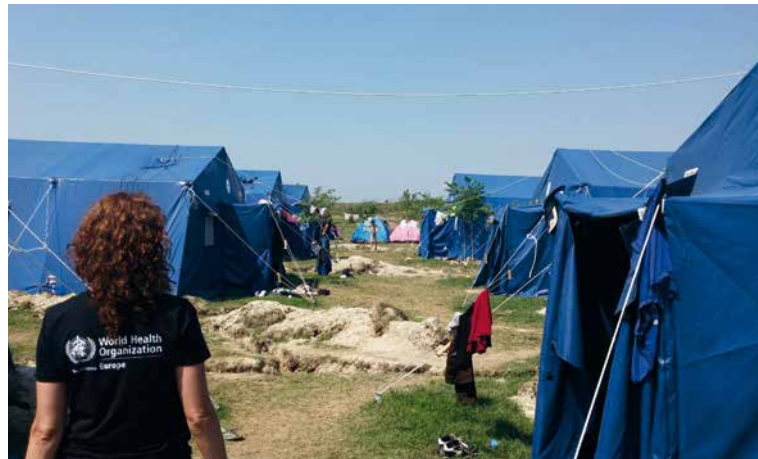
Fig. A.5. Kanjiza camp