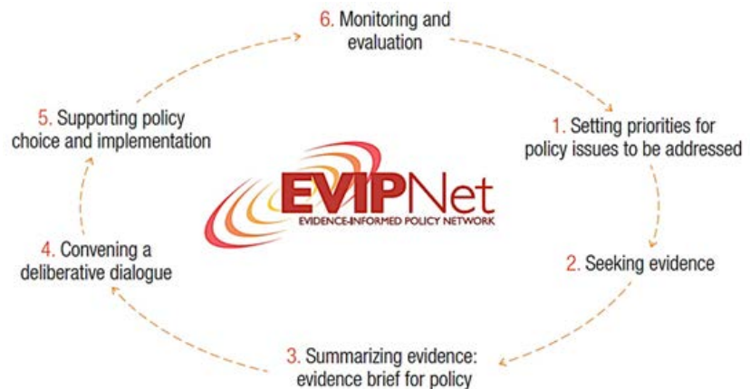
Fig. 2 EVIPNet Europe Action Cycle

Once a country team/KTP is established, its members: