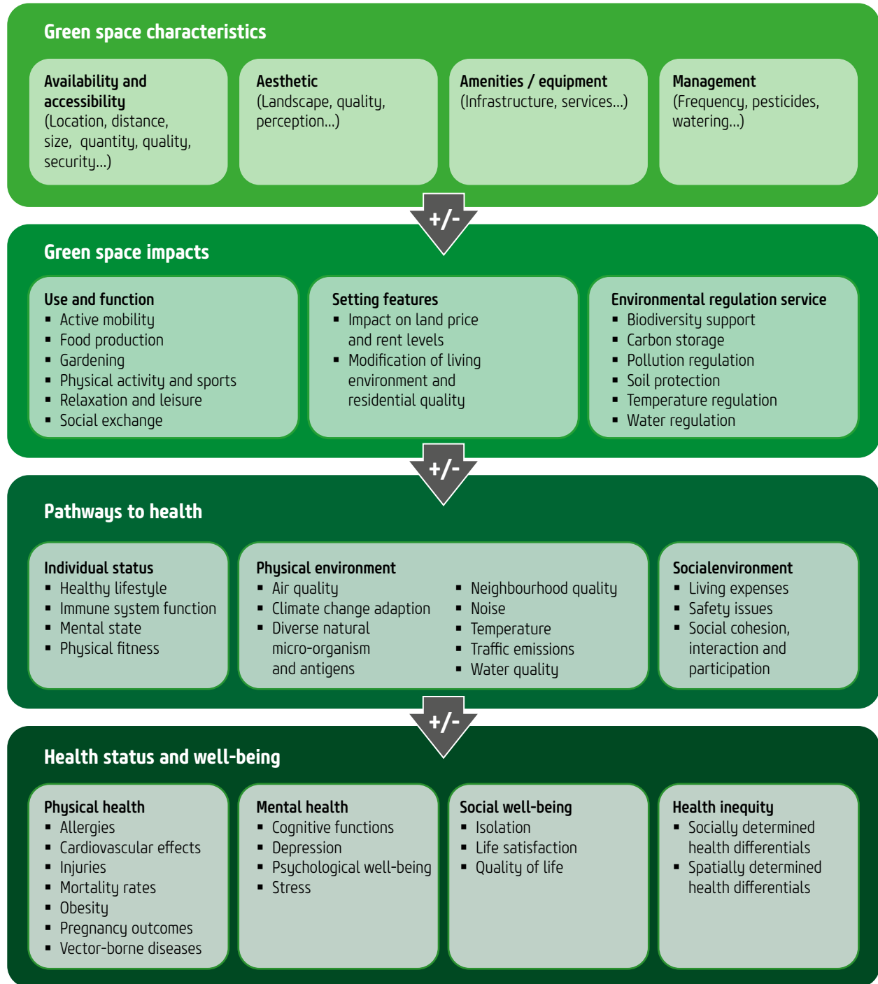
Fig. 1. A causal model of the impacts of urban green spaces on health and well-being