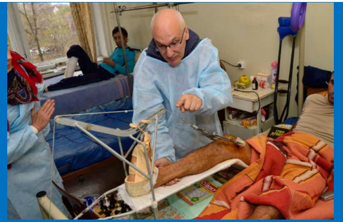
Participants in the training on early physical rehabilitation organized by WHO in Mariupol, Donetsk region, examine a patient during the practical module.