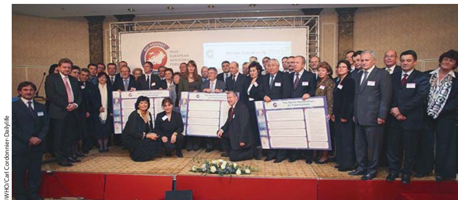
Key participants at the WHO European Ministerial Forum “All against Tuberculosis” in 2007 stand behind the Berlin Declaration on Tuberculosis

reveal serious difficulties with health systems, underlining the need for WHO to work with countries to develop their systems.