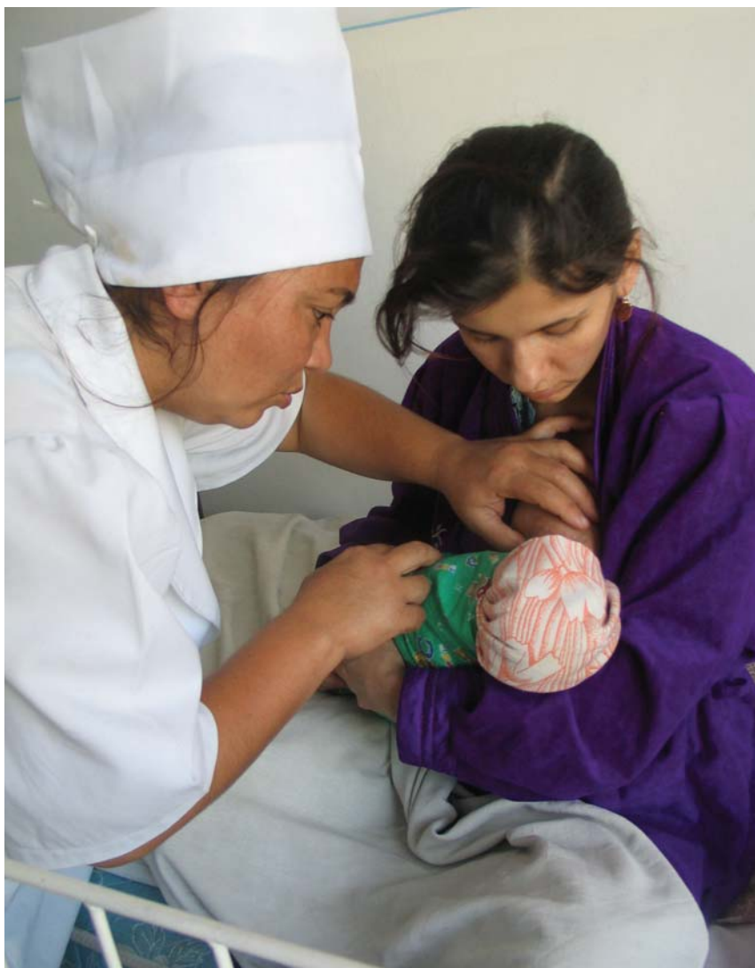
A health professional in Tajikistan advises a new mother on how to give her newborn baby the best start in life

to promote the sexual and reproductive health and rights of young people. The partners – the EC, the International Planned Parenthood Federation (IPPF) European Network, Lund University and the WHO Regional Office for Europe – aimed to develop new ways to build on existing research and transmit sexual and reproductive health information and services to young people.