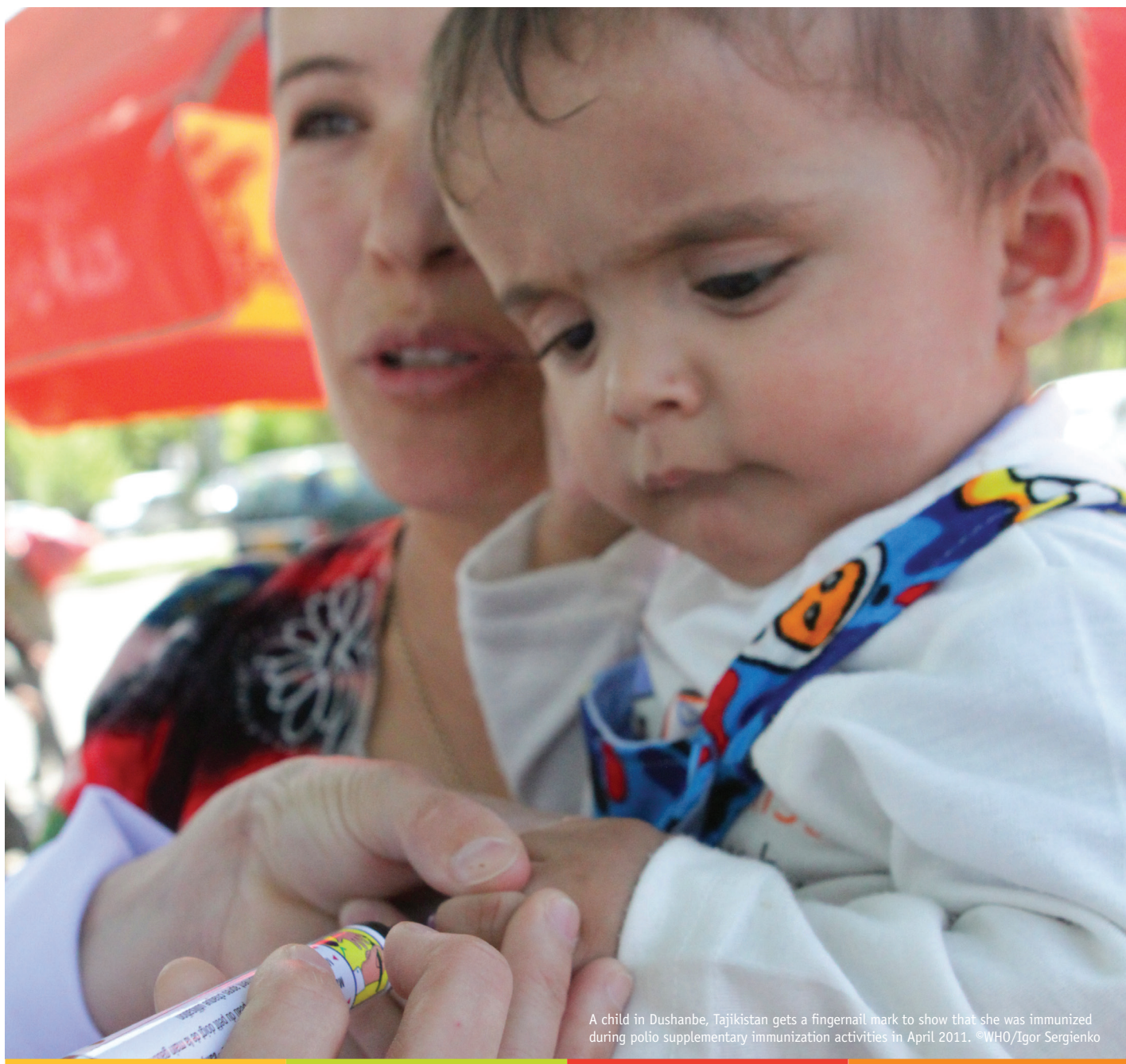
A child in Dushanbe, Tajikistan gets a fingernail mark to show that she was immunized during polio supplementary immunization activities in April 2011.