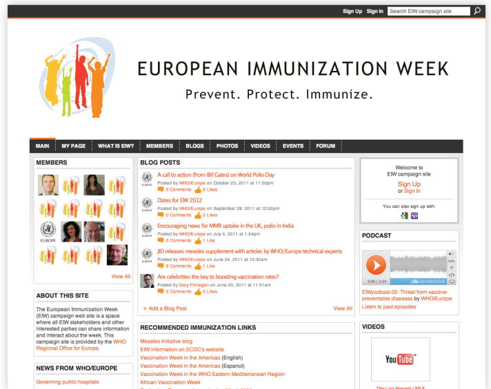
▲ Screen shot of EIW campaign site.

The presence and value of the EIW campaign site, established in 2010, continued to grow during EIW 2011. This interactive social media tool allowed EIW focal points from participating countries to share their EIW experiences directly with an online EIW community by posting blogs, comments and pictures from events. WHO/Europe also utilized the social networking and microblogging tool Twitter to provide real-time updates from key EIW activities throughout the week.