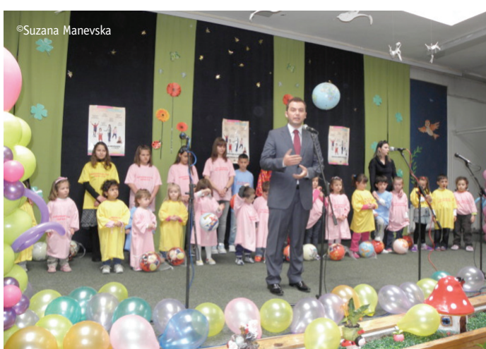
Health minister of the former Yugoslav Republic of Macedonia, Bujar Osmani, with children at an EIW 2011 event.

Visit the EIW campaign site: http://eiw.euro.who.int