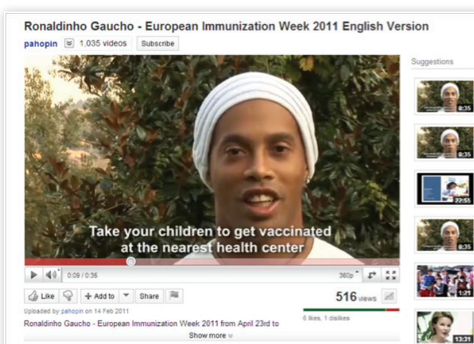
Promotional EIW 2011 video with soccer star Ronaldinho.