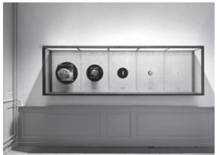
FIG. 3. THE FOCUS OF MEDICAL INVESTIGATIONS OF THE HUMAN BODY FROM THE LATE 18TH CENTURY TO DATE IS DISPLAYED AS A REDUCTIVE SCALE, FROM THE WHOLE HUMAN TO ITS MOLECULES IN THE BODY COLLECTED. BUT NO SIMPLE BUILDING BLOCKS OF HEALTH AND DISEASE HAVE BEEN FOUND.

In the exhibition, the reductive drive of medicine is tempered by peepholes into the personal stories behind the specimens. Little information is preserved about the people whose bodies became part of medical collections, but sometimes we know more. One example is the story of the conjoined twins Martha and Marie, who were nursed and cared for