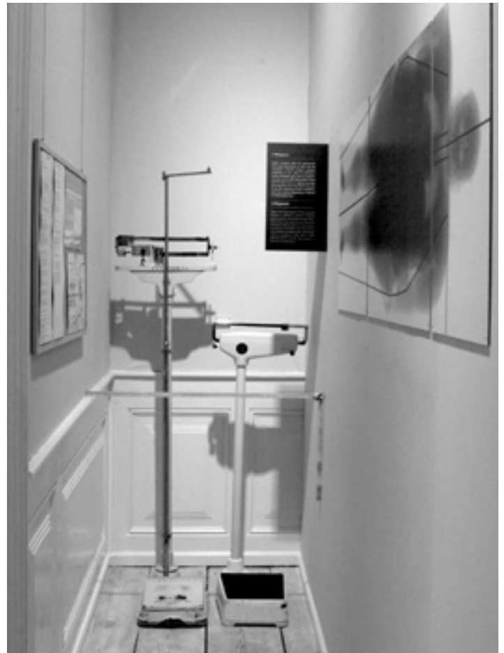
FIG. 2. A DISPLAY ABOUT THE DIAGNOSIS OF MORBID OBESITY IS SITUATED IN A NATURALLY NARROW SPACE, ENCOURAGING VISITORS TO BE CONSCIOUS OF THE SIZE OF THEIR OWN BODIES. UNTIL RECENTLY A STANDARD SCALE COULD ONLY WEIGH UP TO 150 KG, AND TWO SCALES WERE THEREFORE NEEDED FOR SOME PEOPLE.

The exhibition deliberately avoids showing whole human bodies. The only image is the full-sized reproduction of a scan of a woman diagnosed with