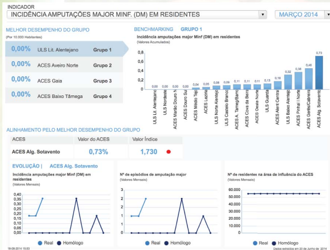
Fig. 2. Benchmarking screenshot of a selected indicator: incidence of major amputations among residents with diabetes mellitus

Performance evaluation takes place annually at the regional and primary health care centres' group levels and is used predominantly as an improvement tool. Shortcomings are identified based on an analysis of indicators and by benchmarking. Regional health authorities and providers discuss ways to overcome suboptimal performance. These discussions lead to improvement action plans, which form the basis of the contracting process. Performance evaluation is also used to allocate financial incentives.