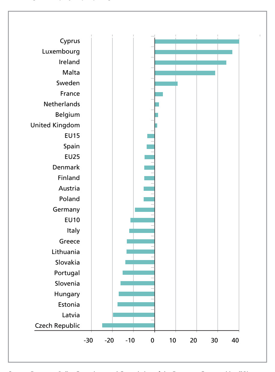
Figure 1. Projected changes in employment (% change of employed people aged 15–64 between 2003 and 2050) EU25