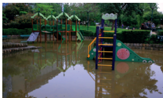
Figure 3: Flooded playground, Paris, France, 2016