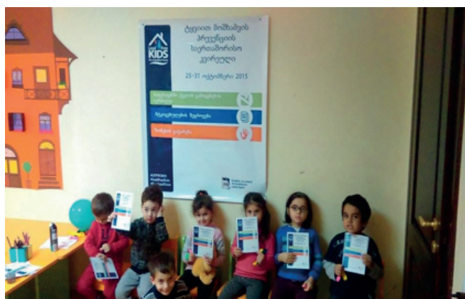
Figure 2: Teaching students about lead in paints