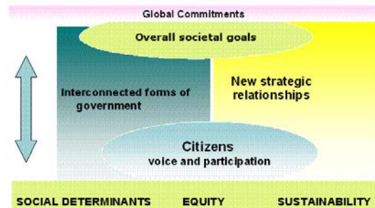
The 21st century approach to governance for health

Which empowerment strategies are we working with in the WHO Regional Office for Europe?