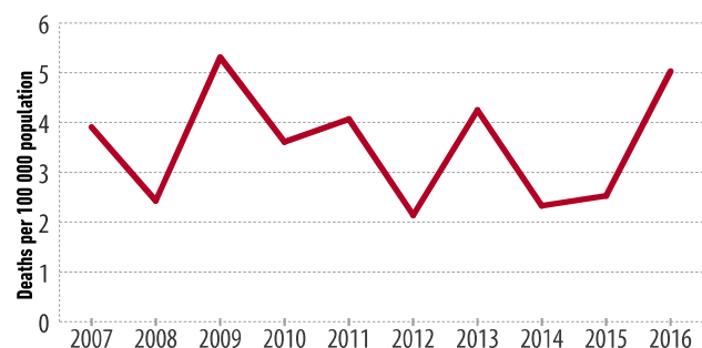
Trends in reported road traffic deaths

Source: 2016, Malta National Mortality Register, Directorate for Health Information and Research