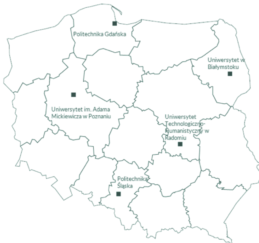
Fig. 2. Universities selected to participate in the study

In the academic year 2015/2016, these were attended by 1 405 100 students; 1 075 200 (76.5% of the overall student population) at public higher education institutions and 329 900 students (23.5%) at private ones. The largest proportion of students attended universities (422 200) and higher schools of technology (301 400).