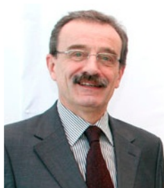
Mr Hido Biš evi Secretary General Regional Cooperation Council

Regional cooperation in the health sector has produced important results. The network has successfully implemented regional action in several key fields, such as safe food products, mental health services, blood transfusion, tobacco control, maternal and neonatal health, communicable diseases and public health school. They all aim at improving public health systems across SEE.