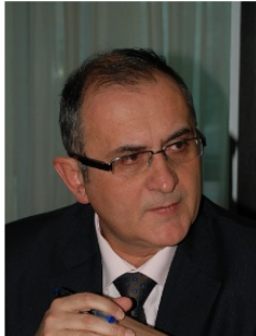
Dr Petrit Vasili Minister of Health, Albania

The SEE Health Network was established in 2001 and consists of the Ministries of Health of Albania, Bosnia and Herzegovina, Bulgaria, Croatia, Montenegro, Republic of Moldova, Romania, Serbia, and The former Yugoslav Republic of Macedonia.