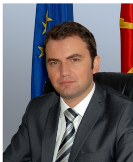
Dr Bujar Osmani Minister of Health, Republic of Macedonia