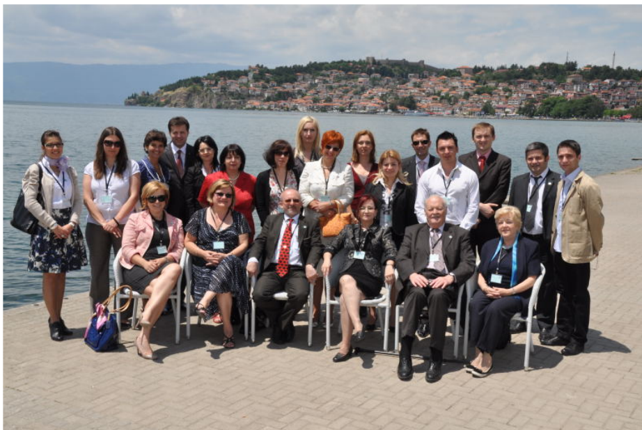
23rd meeting of SEE Health Network, Ohrid, June 2010

Council of Europe Council of Europe Development Bank WHO Regional Office for Europe