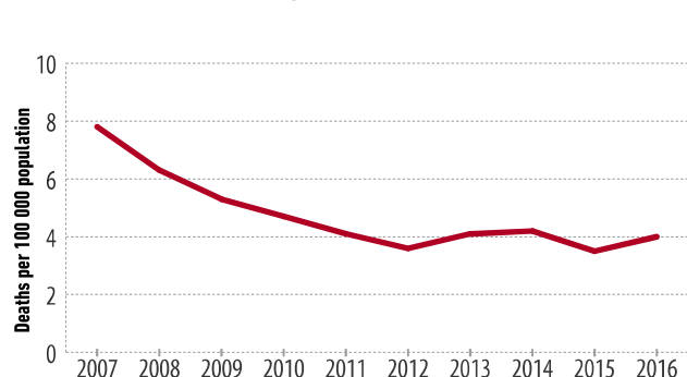
Trends in reported road traffic deaths