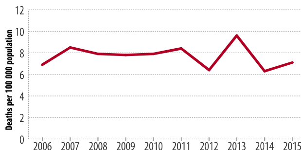
Trends in reported road traffic deaths