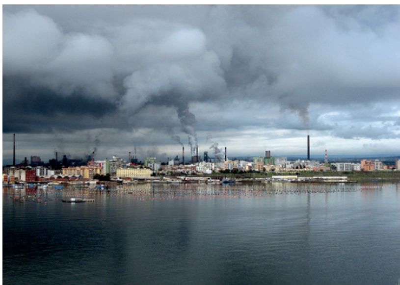
Figure 3: Industrial sources of pollution are often found in densely populated areas