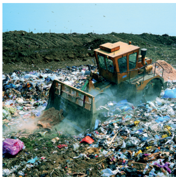
Figure 4: Landfilling operations