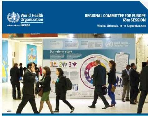
WHO reform: progress and implications for the European Region