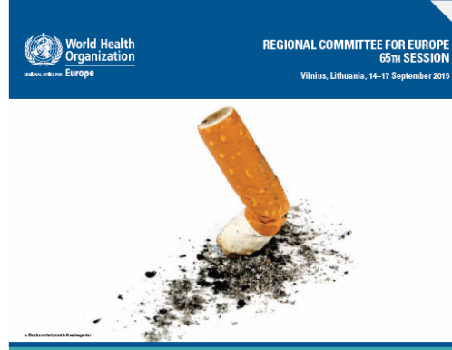
Roadmap of actions to strengthen implementation of the WHO Framework Convention on Tobacco Control in the European Region 2015–2025: making tobacco a thing of the past