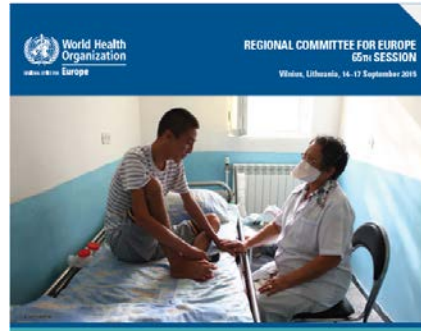
Tuberculosis action plan for the WHO European Region 2016–2020