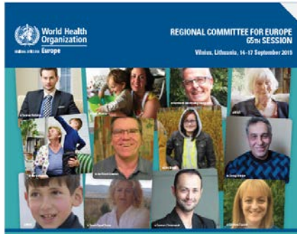
Priorities for health systems strengthening in the WHO European Region 2015–2020: walking the talk on people centredness