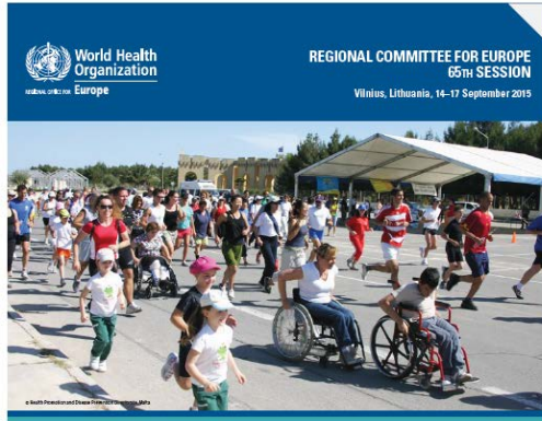
Physical activity strategy for the WHO European Region 2016–2025