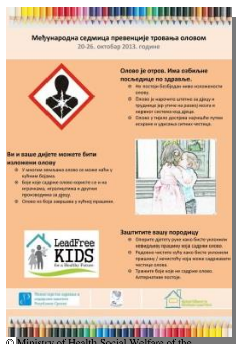
© Ministry of Health Social Welfare of the Republic of Srpska. Poster for the international lead poisoning prevention week of action in the Republika Srpska, Bosnia and Herzegovina

In Albania, during a national multistakeholder workshop held by the Institute of Public Health, Tirana, on 25