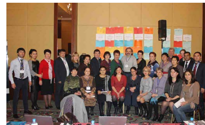
Fig.17: LQSI training for food safety scientists, Uzbekistan

2015. Basic LQSI training was performed for the microbiologist participants on this course (Fig. 17) 11 .