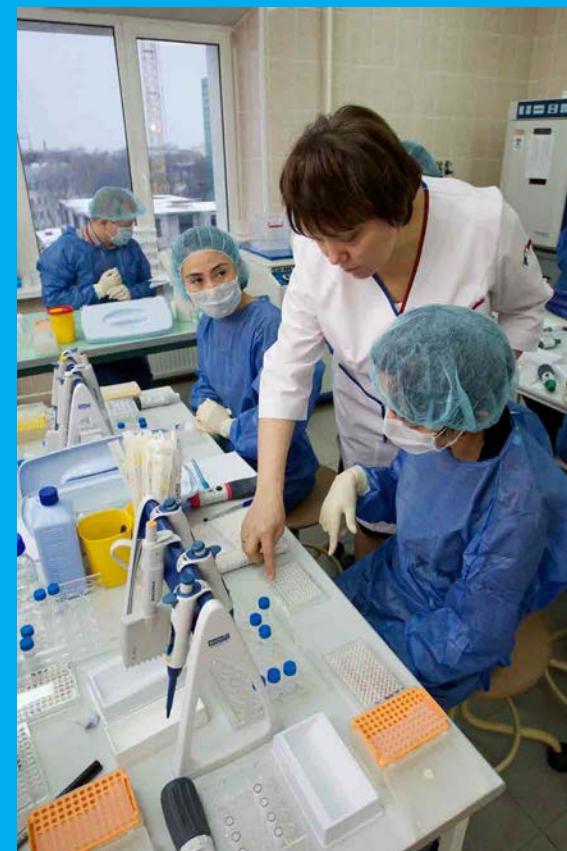
Fig. 3: Laboratory training, St. Petersburg

This report describes progress in Areas 1 and 2.