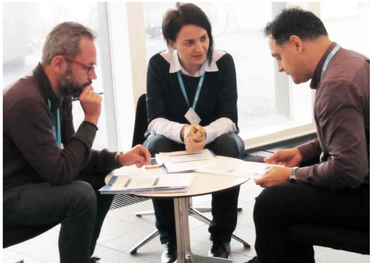
Fig. 5: Mentors training course, Copenhagen