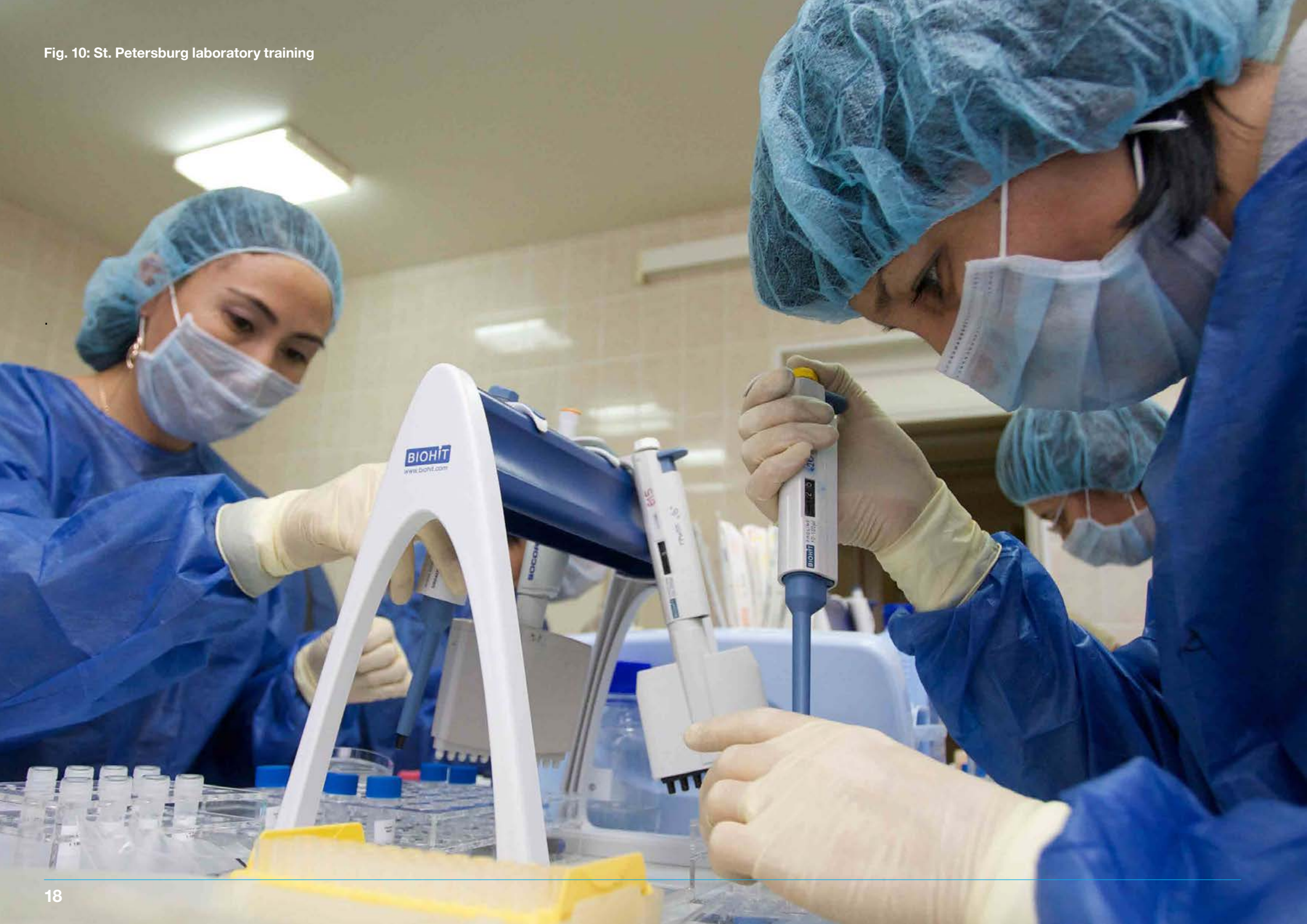
Fig. 10: St. Petersburg laboratory training