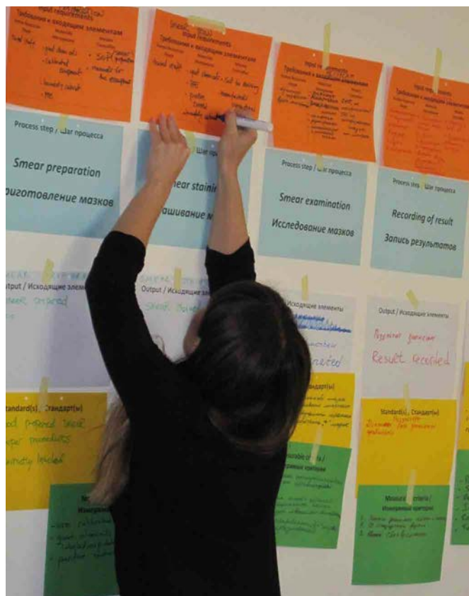
Fig. 14: Process analysis exercise, LQSI training, Copenhagen

Five courses were conducted in 2014 and 2015 (Fig. 13 & 14), involving 110 participants from 75 laboratories from 23 eastern and south-eastern European countries (Fig. 15).