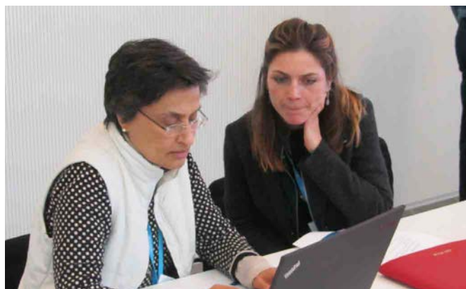
Fig. 18: Mentor training course, Copenhagen

The quality management system affects all routine laboratory processes – staff responsibilities, tasks and authorizations must be adapted, procedures must be revised, and all staff members must accept and implement the necessary changes. As with any process of change, initial resistance from laboratory employees is likely and the laboratory manager therefore needs good management skills. Consequently, a substantial part of the course focuses on leadership, communication, and delegation, and the course provides a conceptual framework (Plan-Do-Check-Act) to build the required management skills.