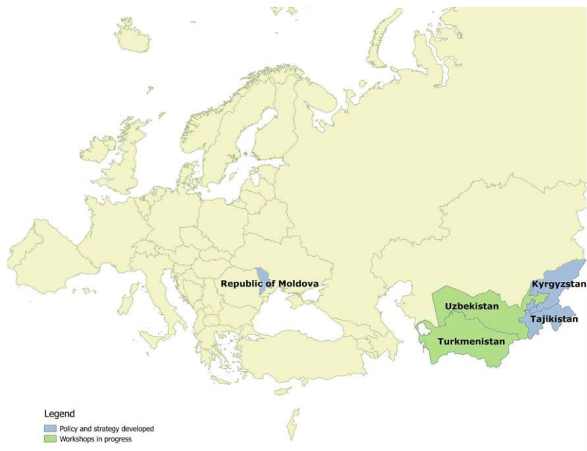
Fig. 9: Progress on laboratory policy and strategy development per country