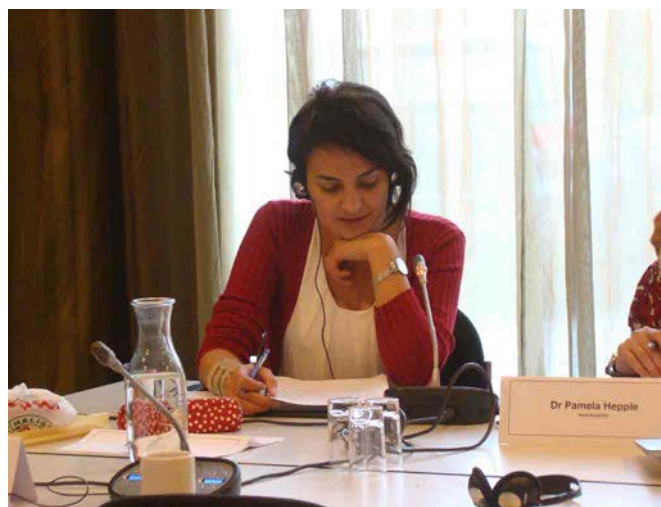
Fig. 13: Training in LQMS implementation using the LQSI tool, Copenhagen

The LQMS Training Toolkit is used to train laboratory managers, senior biologists and technologists in quality management systems as a step towards obtaining national or international recognition, such as ISO 15189.