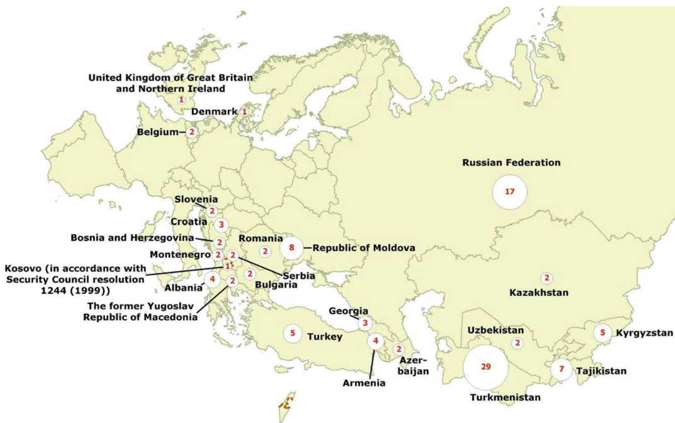
Fig. 15: Number of people trained in LQSI per country

During the workshop, they were briefed on the desired mentoring style and approach, and tested on their quality knowledge and communication aptitudes. They were also introduced to the structure of the LQSI tool and briefed on how to use it in practice 9 .