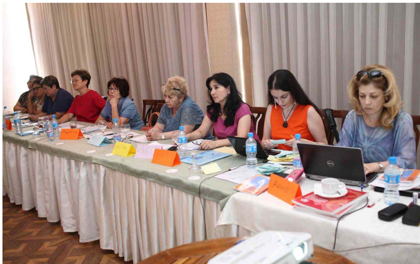
Fig. 4: National laboratory working group meeting, Uzbekistan

NLWGs include national experts who know the national system well and can determine what is needed. These experts represent facilities and services including public health laboratories; clinical diagnostics, chemical, radionuclear, food safety, toxicology, and veterinary services; metrology service, teaching universities and colleges; and laboratory accreditation agencies, as well as the ministries of health and other relevant ministries (e.g. ministries of education, ministries of agriculture and ministries of the environment), and private laboratories.