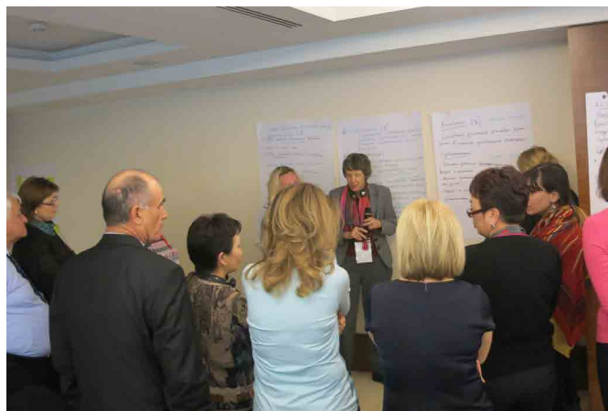
Fig. 21: Curriculum development training, Istanbul.

Support for the Better Labs for Better Health activities described above has been provided by the European Union (European Commission's Directorate-General for International Cooperation and Development) as part of the project on strengthening health laboratories to minimize potential biological risks (contract IFS/2013/332312); Germany's Gesellschaft für Internationale Zusammenarbeit (GIZ); the US Centers for Disease Control and Prevention under a Cooperative Agreement: Five-year Strategy for Reducing Morbidity and Mortality caused by Influenza; the Russian Federation under the donor agreement for Implementation of the International Health Regulations: Core Capacity Building and Response in Selected Countries in the Eastern Mediterranean Region and central Asia; the Partnership Agreement between the Netherlands and WHO; and the Pandemic Influenza Preparedness Framework Partnership Contribution.