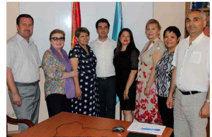
Fig. 2: National laboratory working group, Tajikistan

The overarching goal of Better Labs for Better Health is to improve health by providing timely and accurate laboratory results from quality-assured laboratories that are trusted by the user.