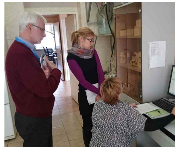
Fig. 16: Mentoring on data management, St. Petersburg

"The Institute has a highly skilled workforce and we saw many examples of good practice, so our work with key staff enabled us to develop the action plan during just a week. It was an excellent start to a long journey."