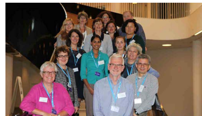
Fig. 1: Mentor training course, Copenhagen

Laboratory Quality Stepwise Implementation tool, along with training modules in Biorisk Management and Infectious Substance Shipping.