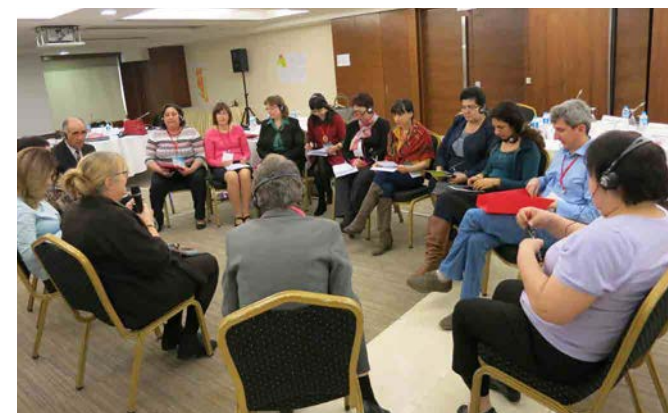
Fig. 11/12: Curriculum development workshop, Istanbul