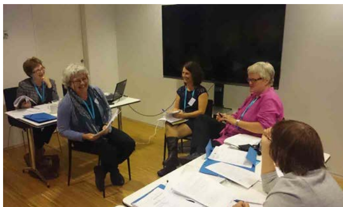
Fig. 19: Mentor training course, Copenhagen

The first three years of Better Labs for Better Health activities focused on establishing methodologies for the standardized development of national laboratory policies and strategies, following the formation of national laboratory working groups, and for curriculum evaluation and development. These methodologies have been documented and shared throughout the Region and through the Better Labs for Better Health website, and through a dedicated online forum (EZCollab) facilitated by WHO to allow discussion and exchange of documents. Information was also shared through the 2014 partners meeting, 12