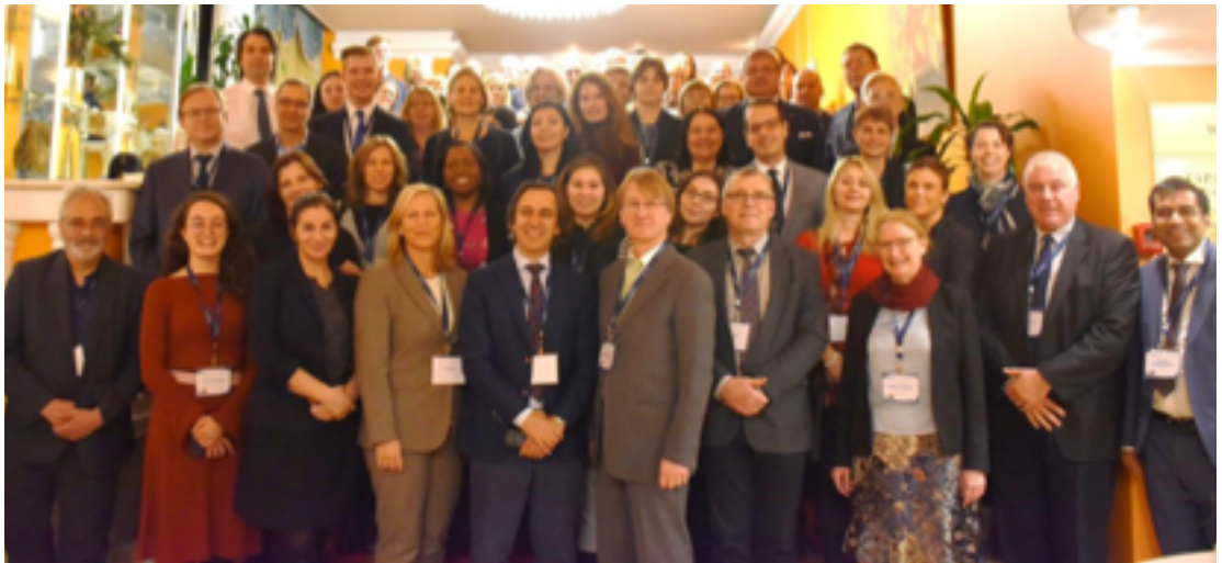
Fig. 3. Participants at the meeting in Moscow, Russian Federation, 5–6 December 2018