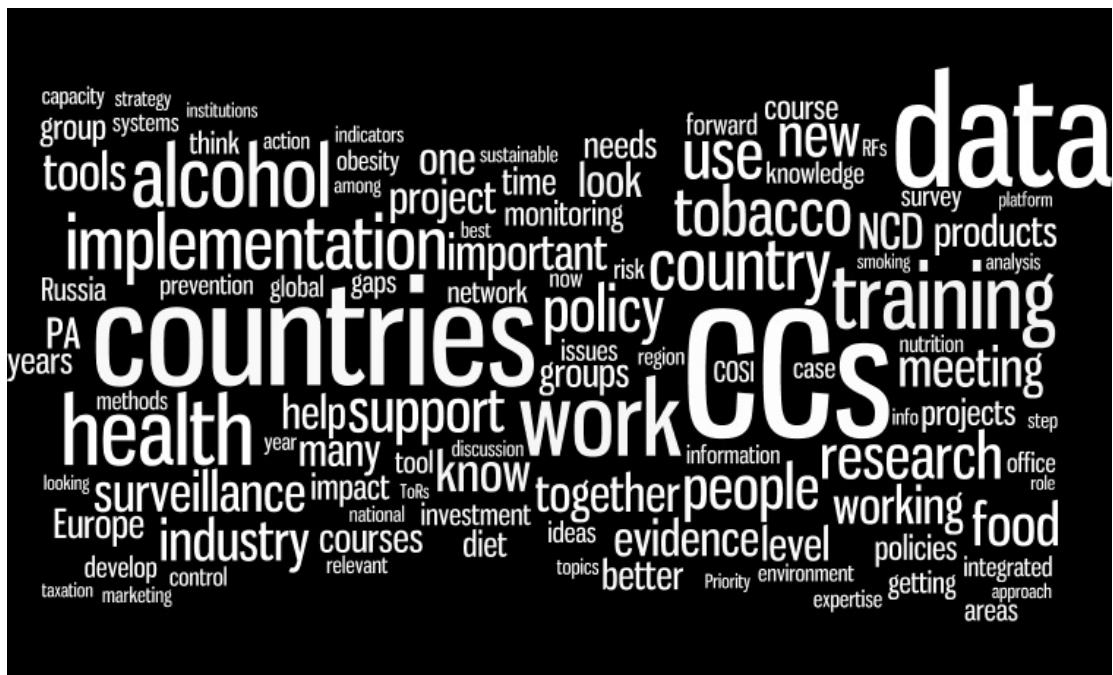
Fig. 2. Word cloud drawn from detailed notes of the discussion over the two days of the meeting